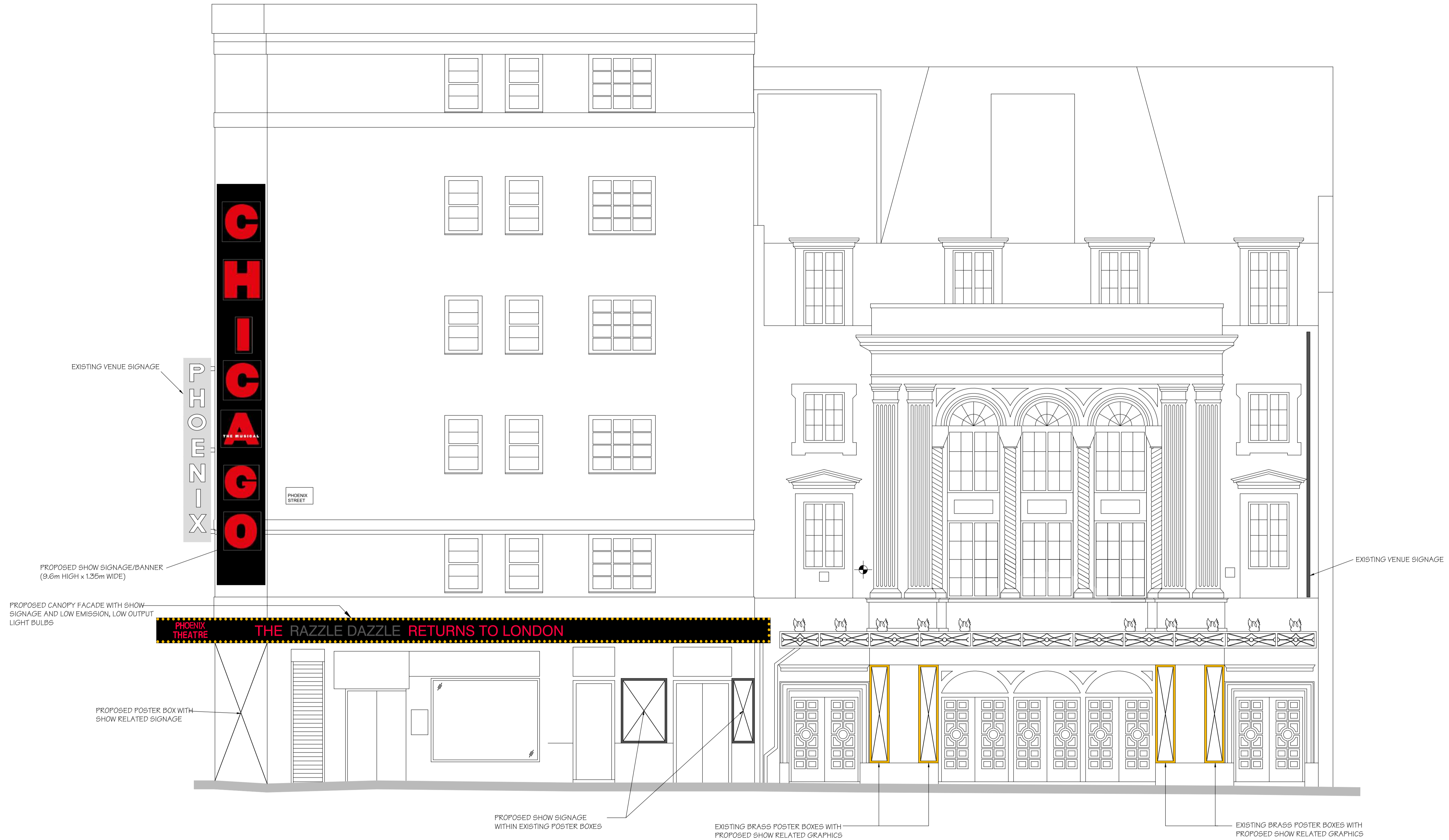
PROPOSED PHOENIX STREET ELEVATION (SCALE 1:50 AT A1)