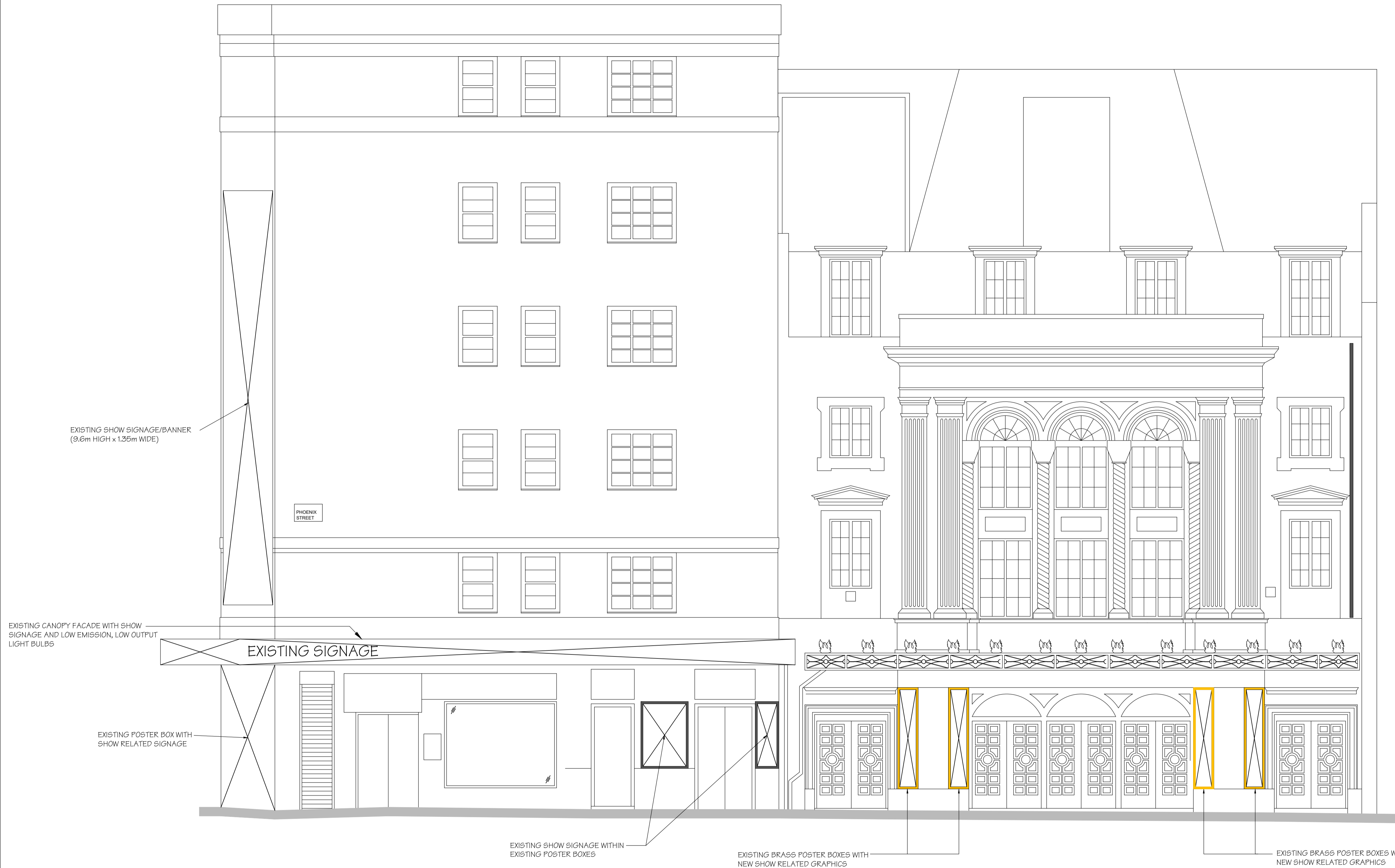
EXISTING PHOENIX STREET ELEVATION (SCALE 1:50 AT A1)