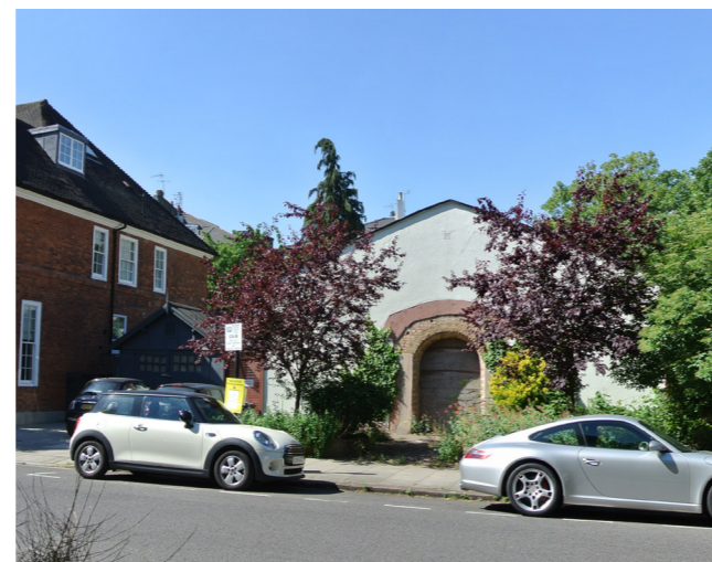
Church and garage