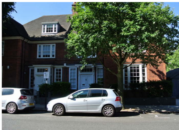
34 Glenilla Road

The buildings to the east of the site are more traditional in style with pitched roofs and red brick whereas to the west the architecture is more recent with flat roofs and examples of more modern materiality.