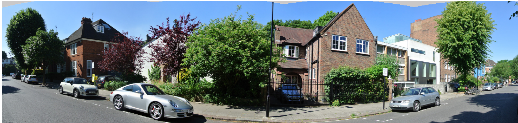
View along Glenilla Road looking south