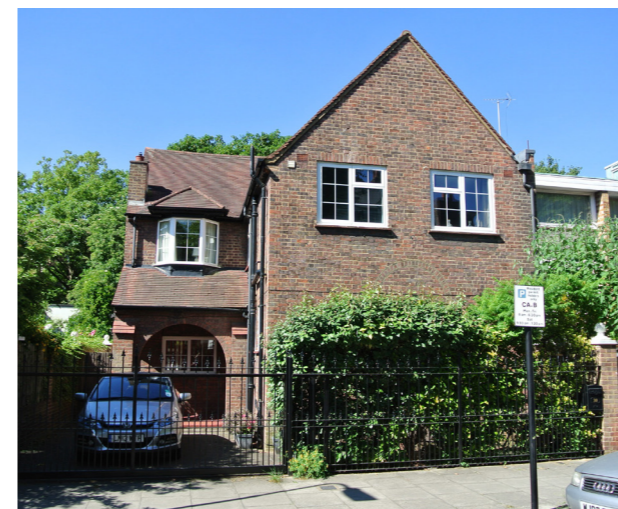
30 Glenilla Road