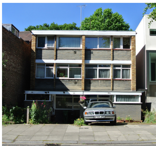
28a & 28b Glenilla Road