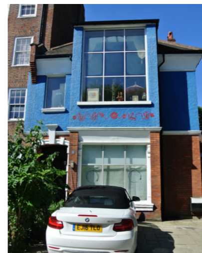
12 Glenilla Road