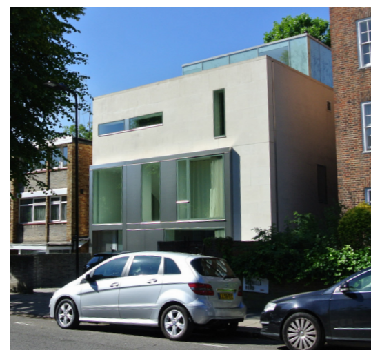
28 Glenilla Road