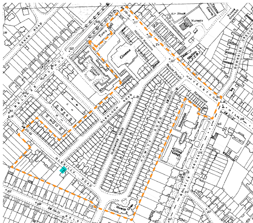
Site Map, 1930s