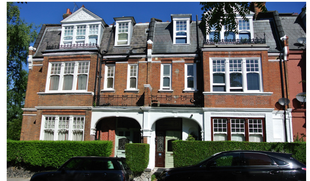
Typical example of early 20th Century red brick houses along Glenloch Road