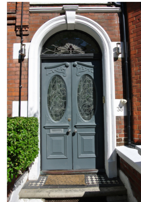
Typical example of art nouveau detailing on front doors within Belsize Park CA