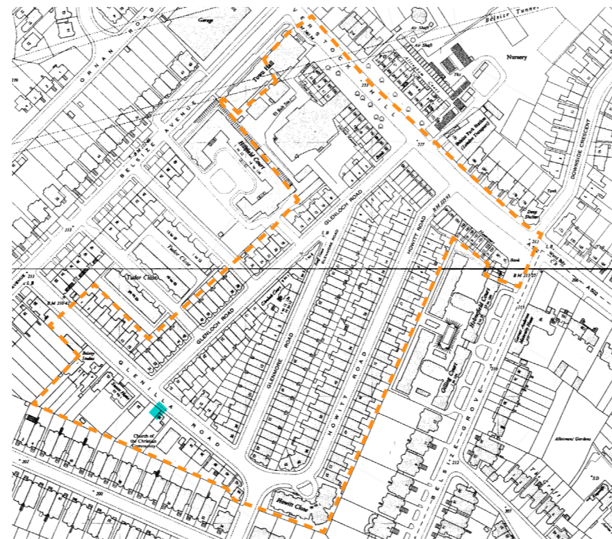
Site Map, 1950s