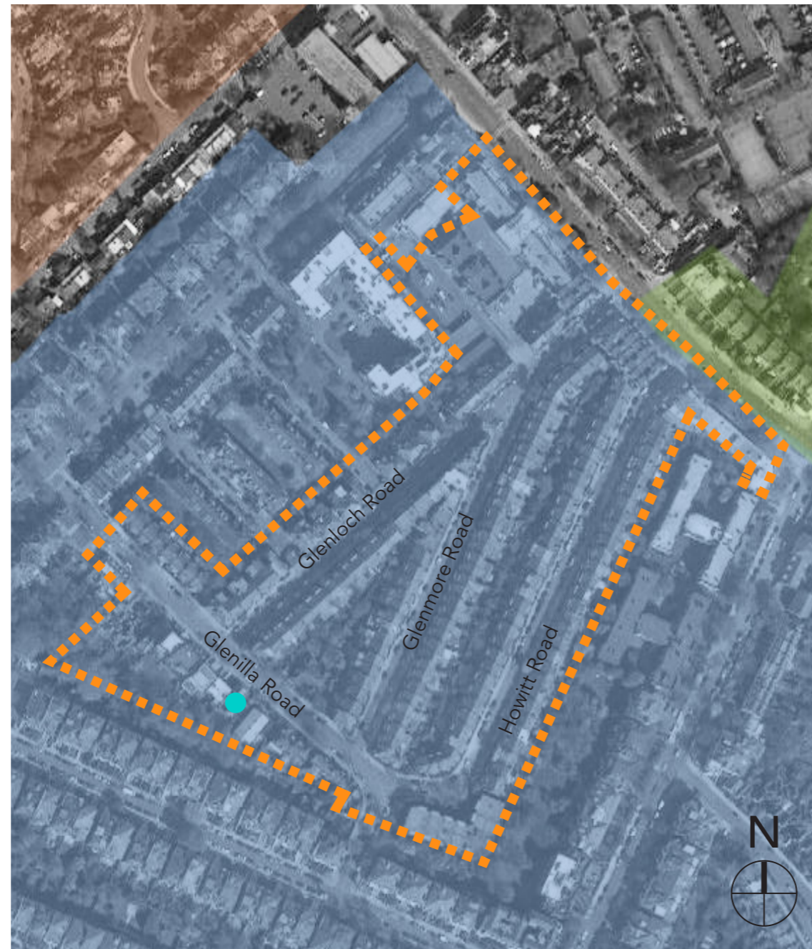
Site Location Plan (not to scale)