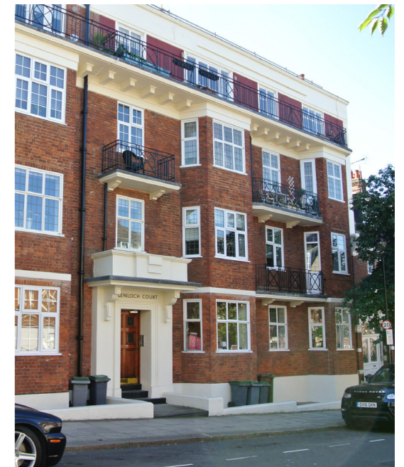
Apartment block on Glenloch Road