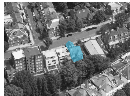
Aerial view of site looking North East