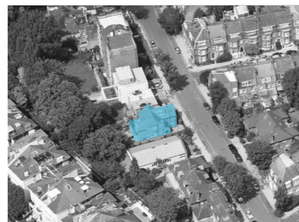
Aerial view of site looking North West