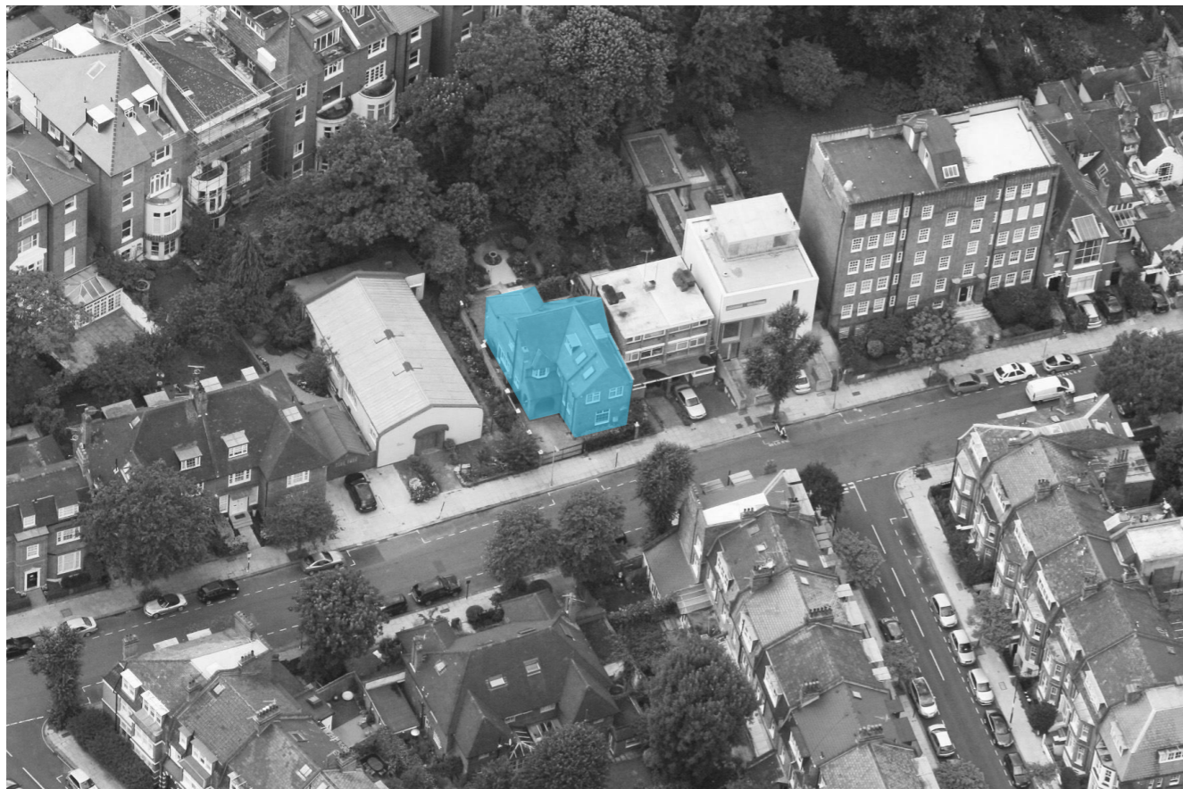
Aerial view of site looking South West with site highlighted in blue