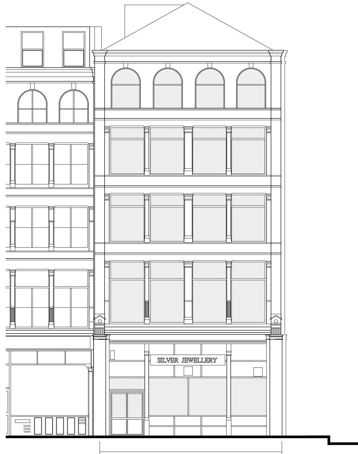
1 North Elevation