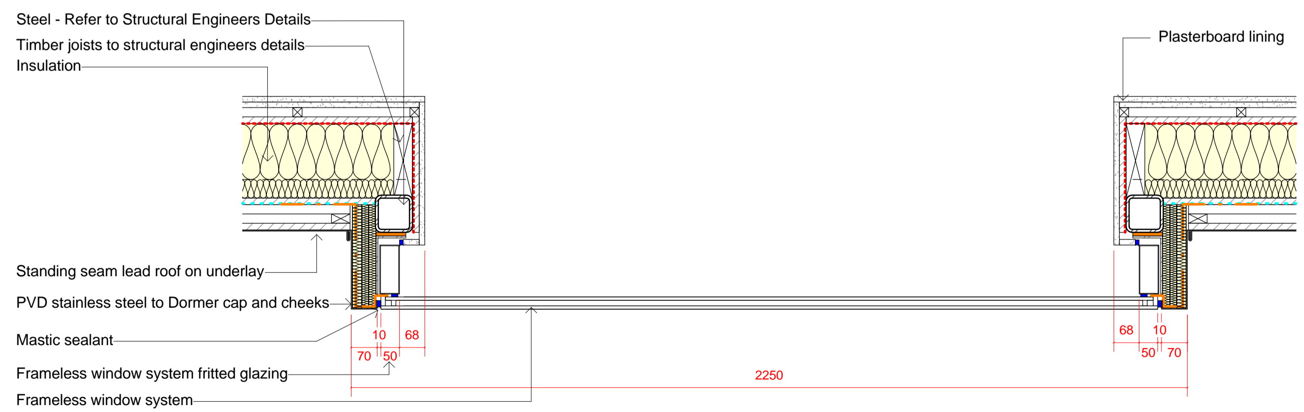
3 25 Denmark Street Dormer Jamb Detail Scale: 1 : 10