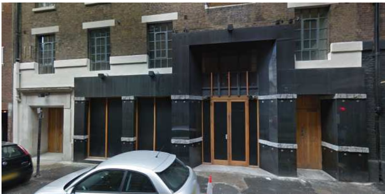
Fig.3 Shelton Street Existing Façade, 2017