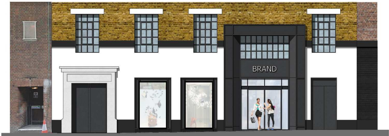
Fig.5 Shelton Street Proposed Façade