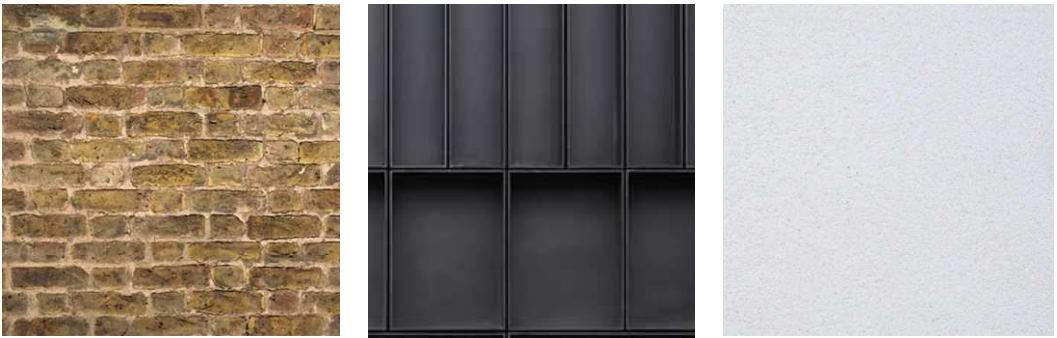
Existing London Stock Yellow Brick Dark Grey Metal Cladding White Render

In order to restore the building to its original authentic character, this theme of black, white, red and yellow colours will be used throughout on the joinery, steelwork, brickwork and other details as appropriate. The double height stone gate frame will be re-clad with dark grey sheet metal panels, and the proposed full height display bay windows will be framed by U profile steel beams. The black granite cladding on the existing ground floor shopfront façade will be stripped away, and replaced with white render, much like the historic façade of 1974 (Fig.4) The timber panel doors of the residential entrance and the refuse storage will be replaced by dark grey metal panel doors, and the colour will match the proposed gate and window frames.