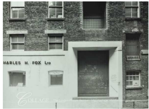
Fig.4 Shelton Street Façade, 1974