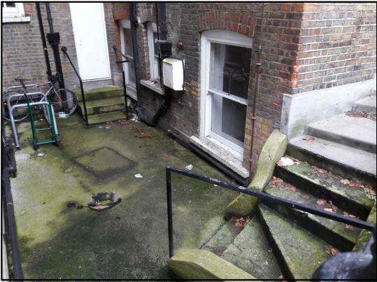
Existing photograph of Elevation 4

Ingleton Wood LLP shall have no liability to the Employer arising out of any unauthorized modification or amendment to, or any transmission, copy or use of the material, or any proprietary work contained therein, by the Employer, Other Project Team Member, or any other third party. All dimensions are to be checked and verified on-site by the Main Contractor prior to commencement; any discrepancies are to be reported to the Contract Administrator. This drawing is to be read in conjunction with all other relevant drawings and specifications Do Not Scale © Ingleton Wood LLP