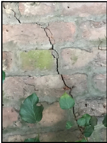
Crack in boundary wall