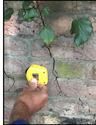
Crack in boundary wall