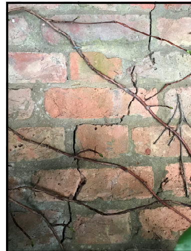
Crack in boundary wall