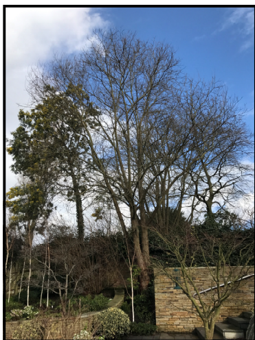
Goat Willow T2