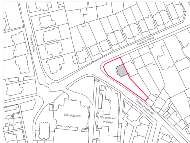
Above, site plan

2 Cannon Place is within the Hampstead Conservation Area and within the setting of three GII listed buildings: 1 Cannon place, Christ Church and Christ Church School.