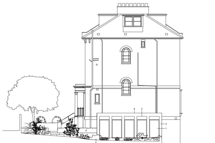
Above, side elevation of approved side extension