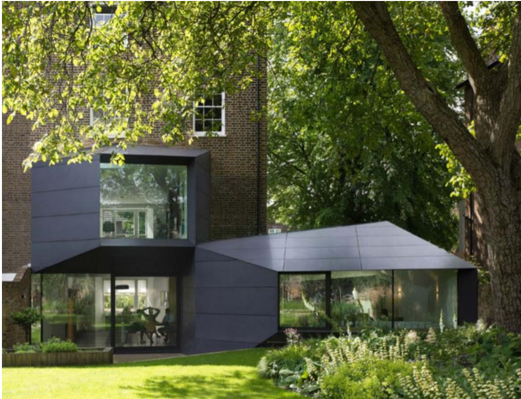
Above, the Lens House by Alison Brooks Architects

The proposed side extension continues in a tradition within Hampstead for high quality contemporary design and careful juxtapositions between the old and the new. Similar extensions have been granted planning permission throughout London. One example includes a two-storey, copper clad extension on Pond Street by Belsize Architects that was shortlisted for a Camden Design Award. Another is the Lens House in Canonbury, Islington, by Alison Brooks Architects, a widely celebrated project which received an RIBA Regional Award and a nomination for the 2014 Manser Medal.