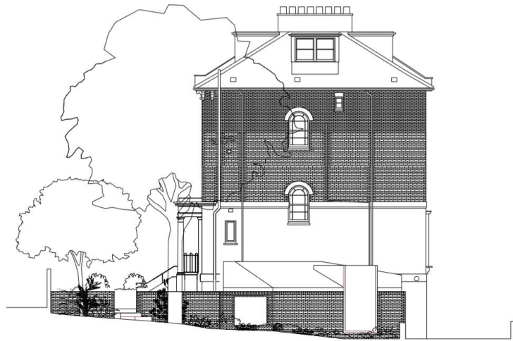
Above, proposed side elevation