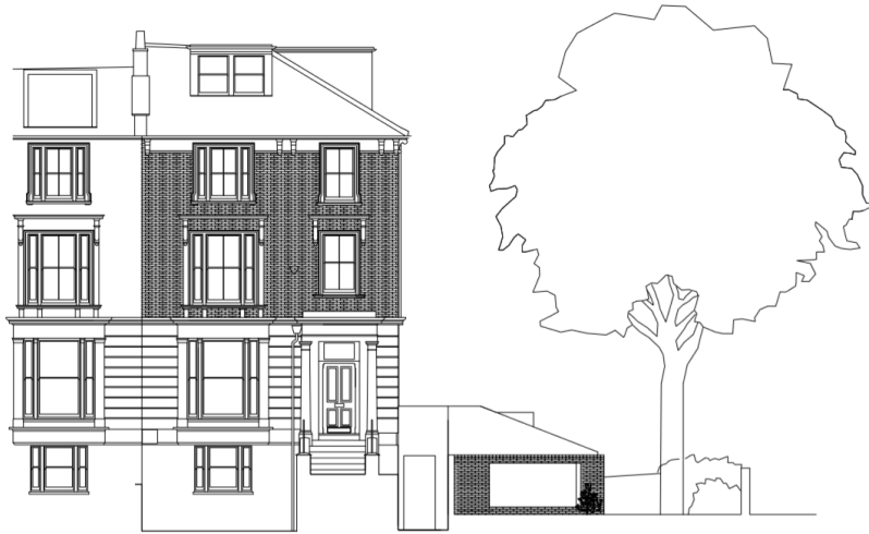
Above, proposed front elevation