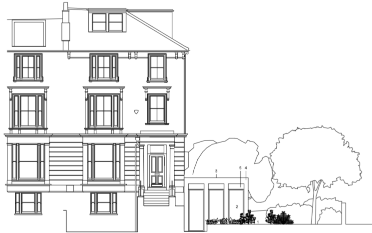
Above, front elevation of approved side extension