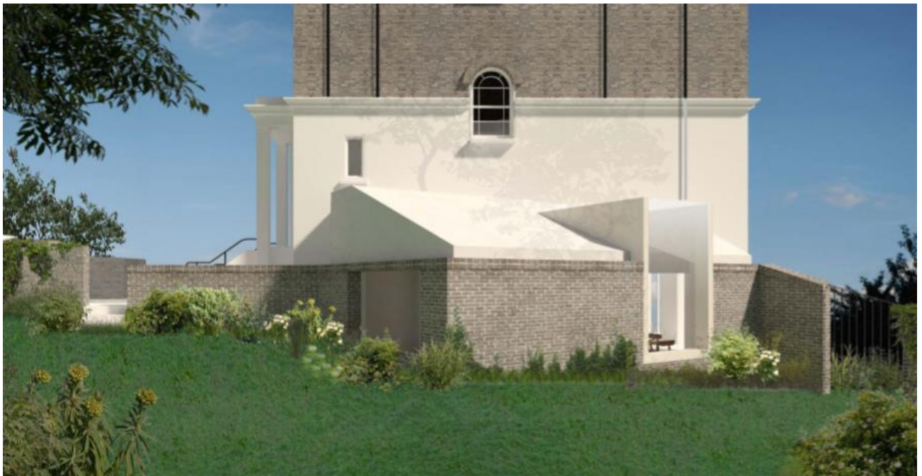
Proposed side extension, side elevation