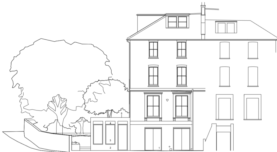
Above, rear elevation of approved side extension