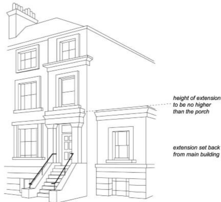
Figure 3. Side extensions