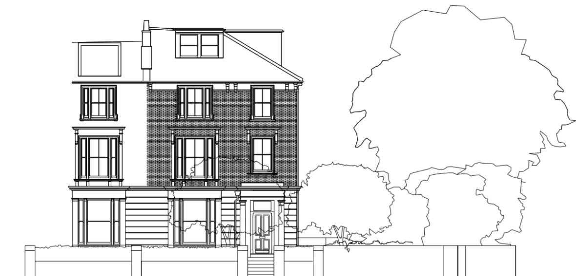
Above, proposed townscape views and the proposed front elevation showing how the proposed side extension is barely visible behind the boundary wall and dense planting