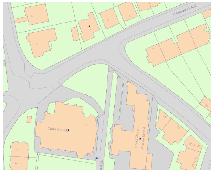
Above, the listed buildings

2 Cannon Place is within the Hampstead Conservation Area and within the setting of three GII listed buildings: 1 Cannon place, Christ Church and Christ Church School.