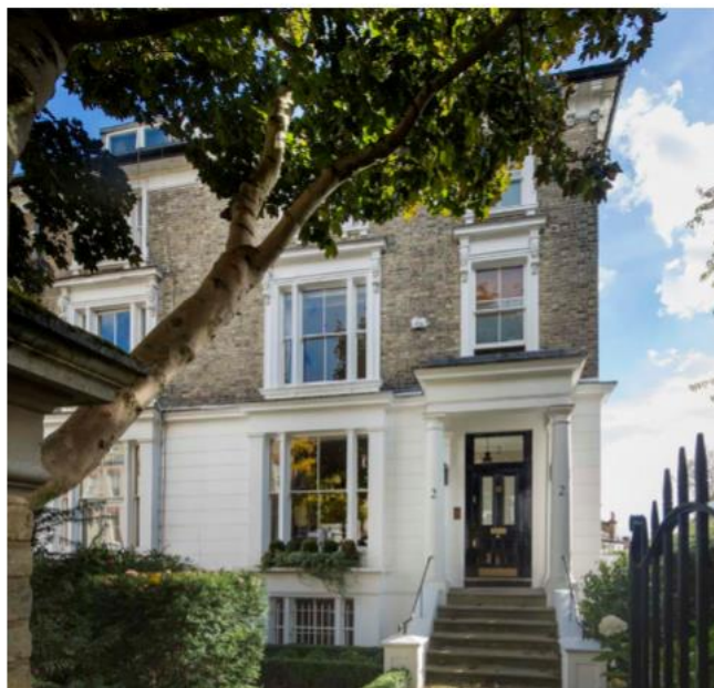
Above, 2 Cannon Place