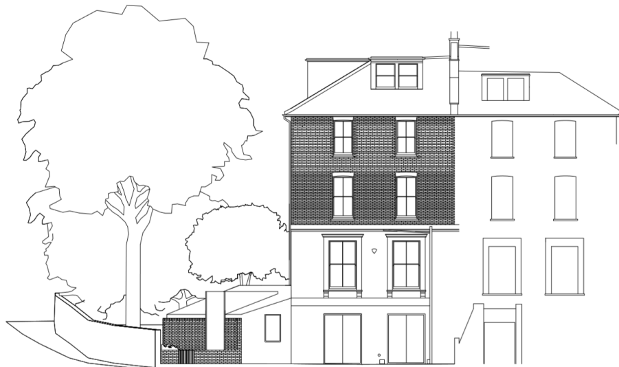
Above, proposed rear elevation