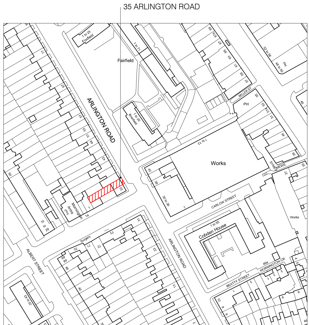
01 LOCATION PLAN scale 1:1250