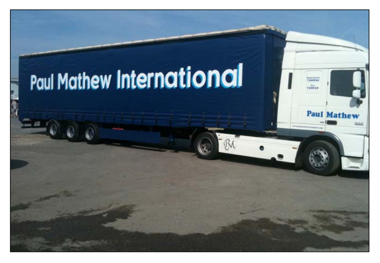
Figure 1.1: Vehicle Used