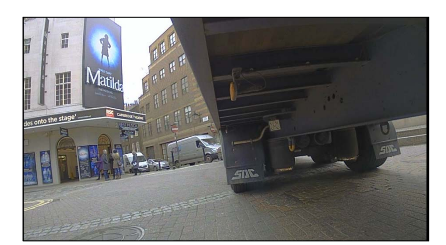
Figure 1.5: Image 4