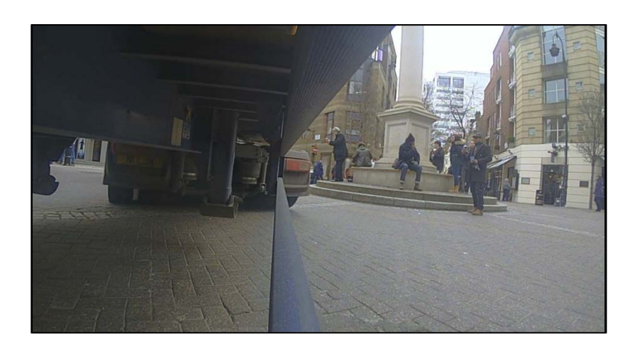
Figure 1.2: Image 1