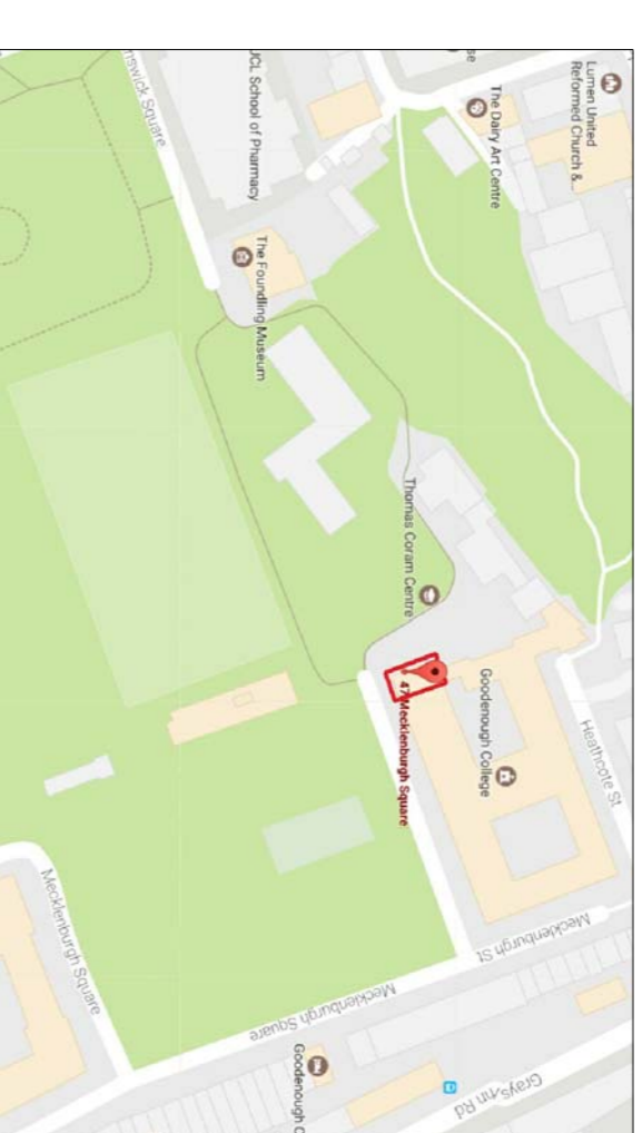
Site Location Scale 1:50 @ A1