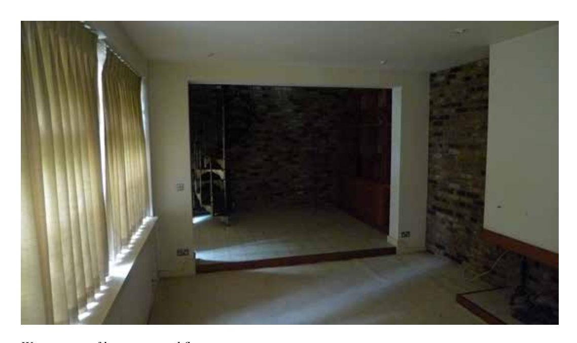
West corner of house, ground floor