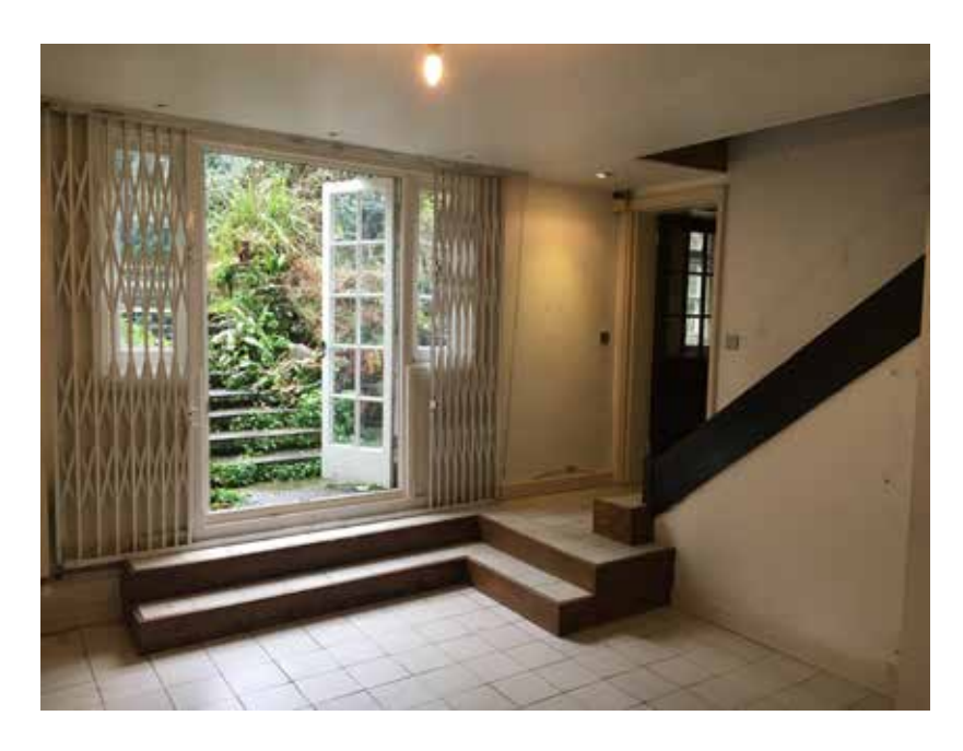
Ground floor room facing South with steps leading up into the garden