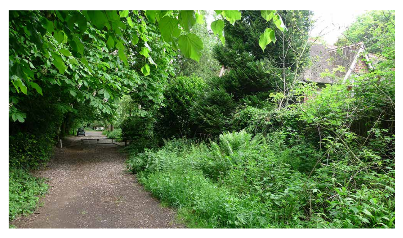
Partial view back to house from lane which merges into North End Avenue, Heath Extension (May 2017)