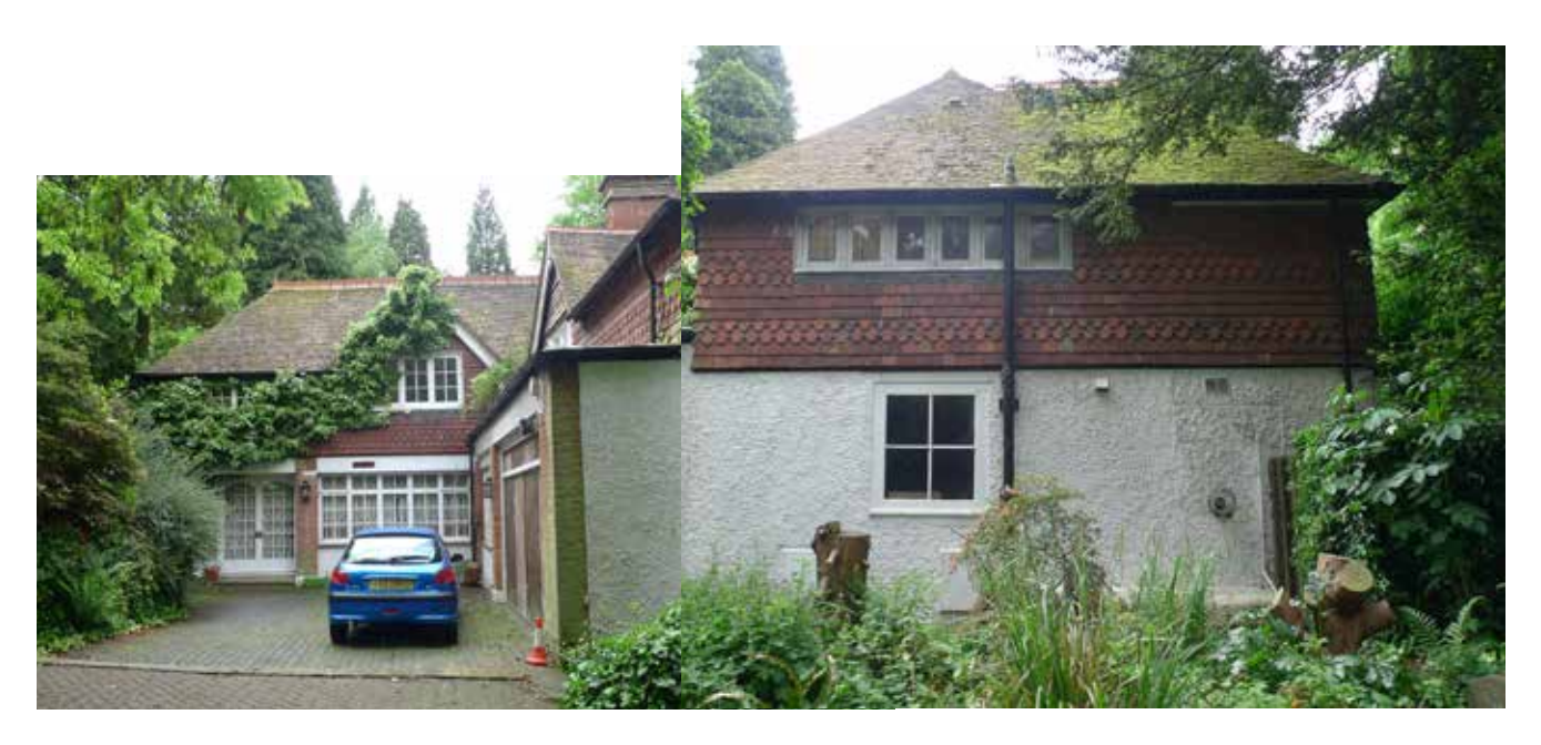
North facade (May 2017)