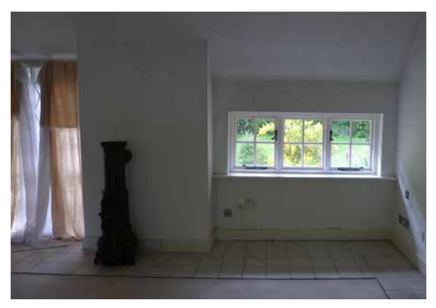
First floor room with potbelly stove overlooking garden to the South