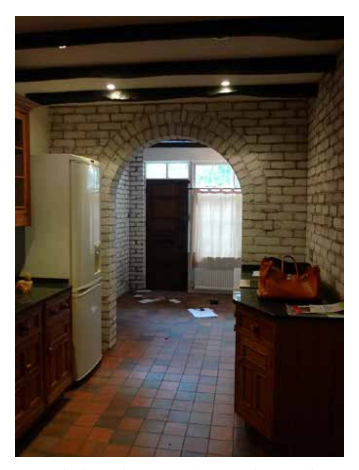
Current kitchen with entrance off of internal courtyard