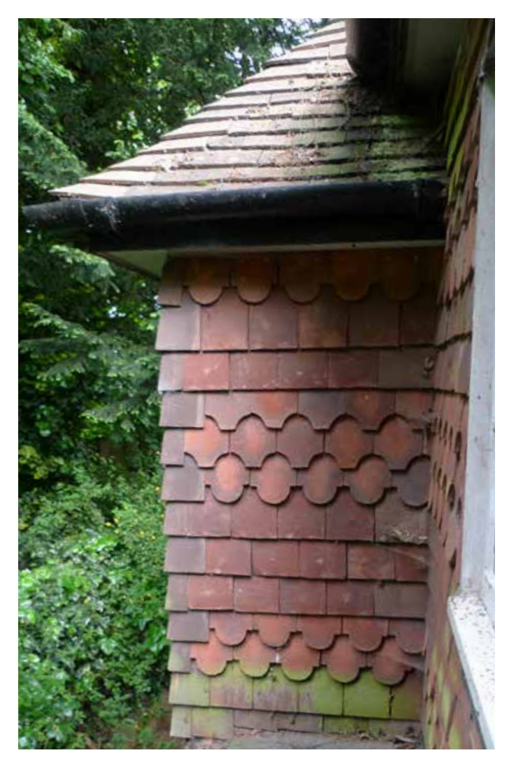
Terracotta\ tiles\ lining\ upper\ storey\ external\ walls