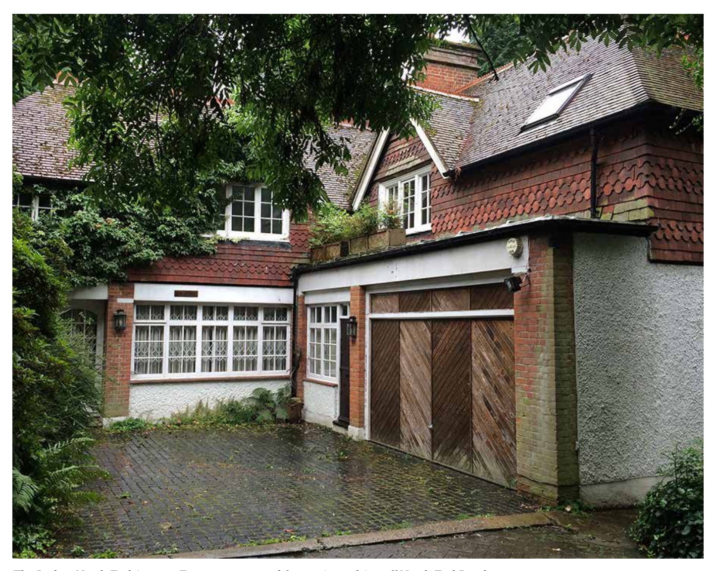
\label{thm:continuous} \textit{The Lodge, North End Avenue. Forecourt accessed from private drive off North End Road.}

The following pages document the current state of the fire station when visited in April 2017 unless otherwise stated.