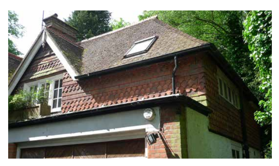
Decoractive terracotta tiles line upper storey and wrap around facades