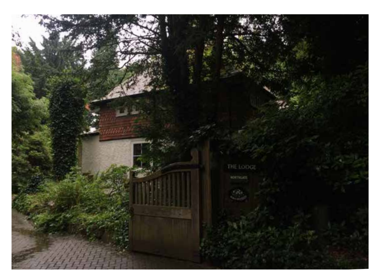
View from approach from north on North End Avenue