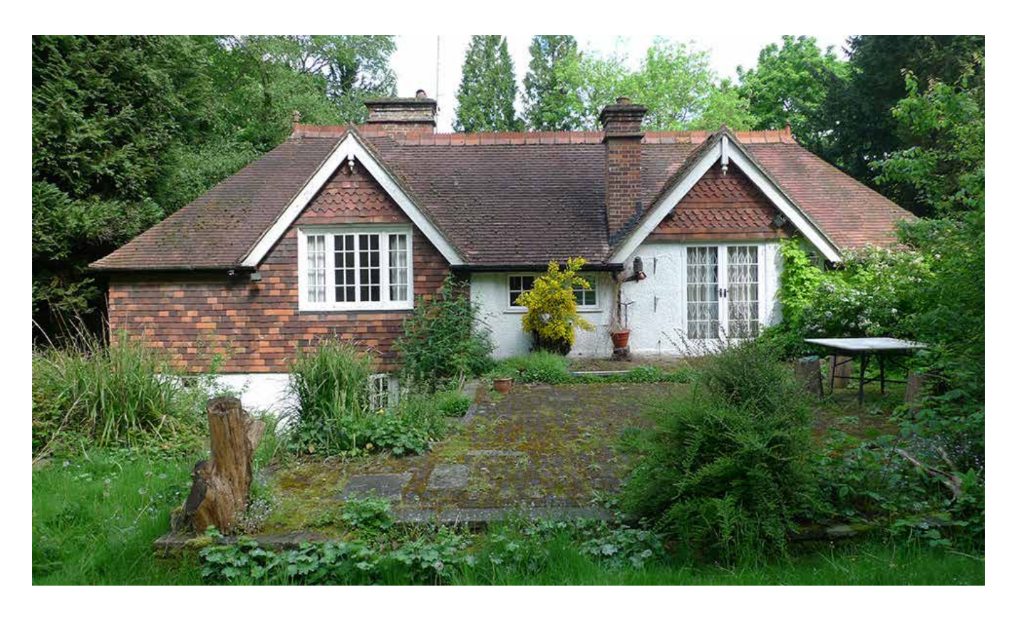
South facade looking out over garden