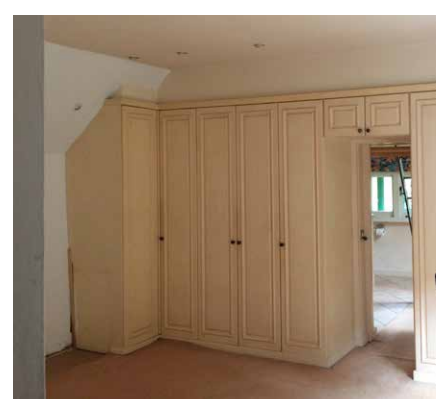
Interior of west wing with lowered ceiling and fixed wardrobes.