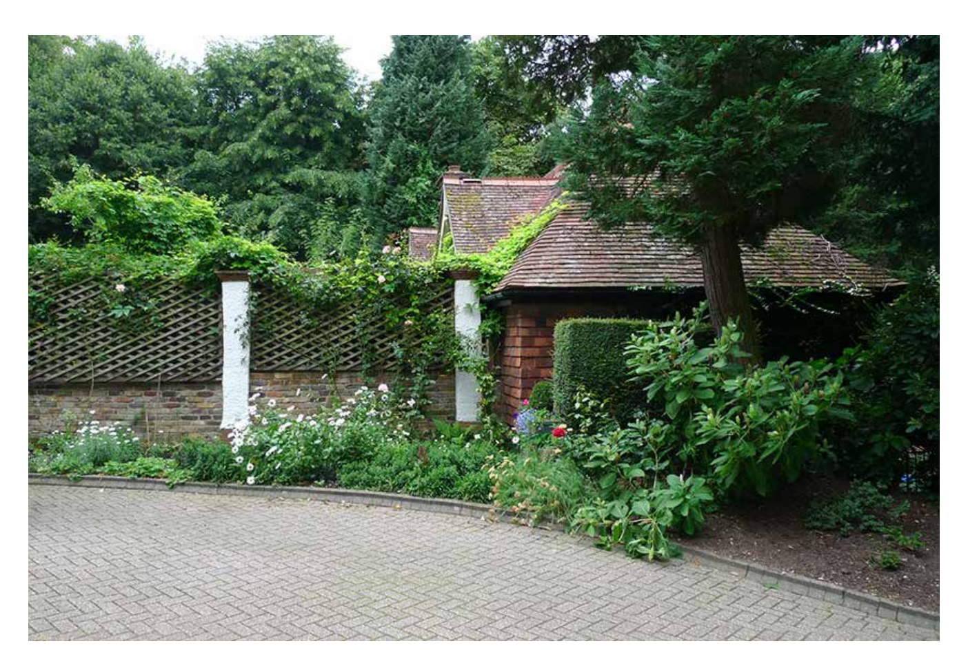
View of The Lodge from Northstead forecourt, far east and south facade gables and roof just visible over boundary wall and fencing.