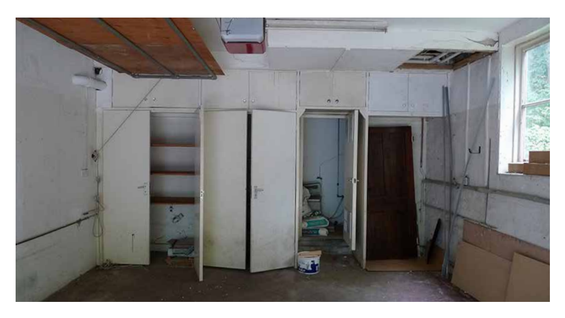
Garage interior, off of internal courtyard