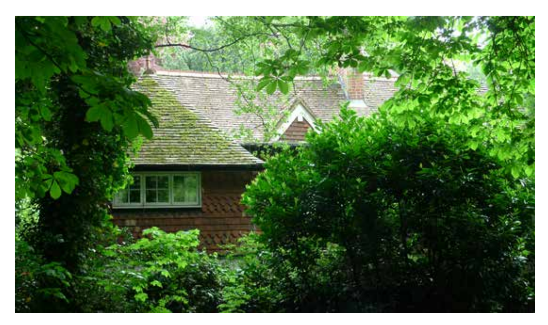
West facade seen from North End Road (May 2017)