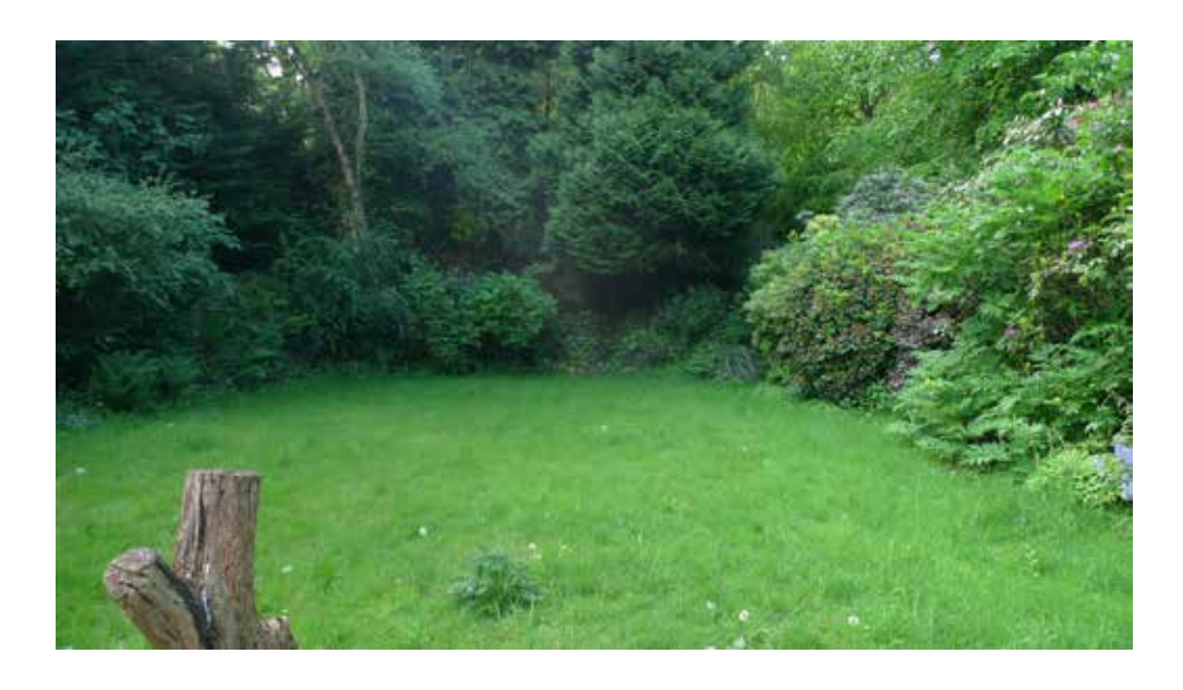
View South into large garden backing onto Sandy Heath, Hampstead Heath Extension