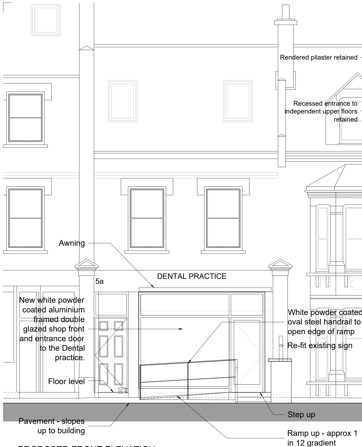
PROPOSED FRONT ELEVATION 5 ELM TERRACE and 1 & 3 Constantine Road