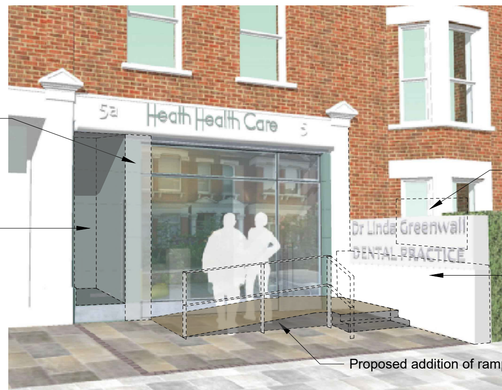
Approved shop front visual indicating proposed alterations