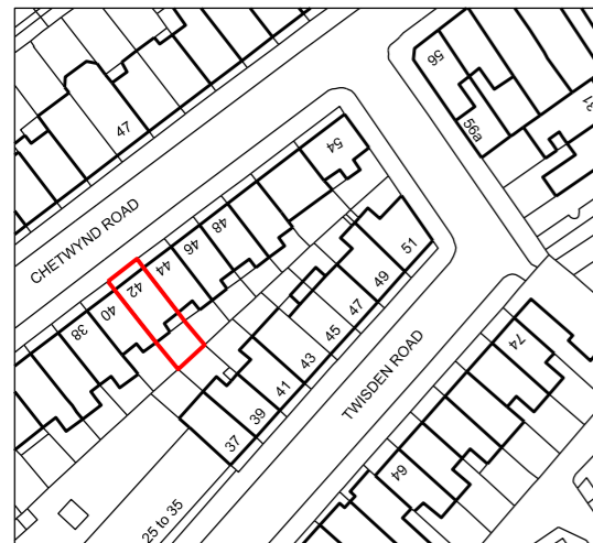
01: LOCATION PLAN SCALE 1:1250