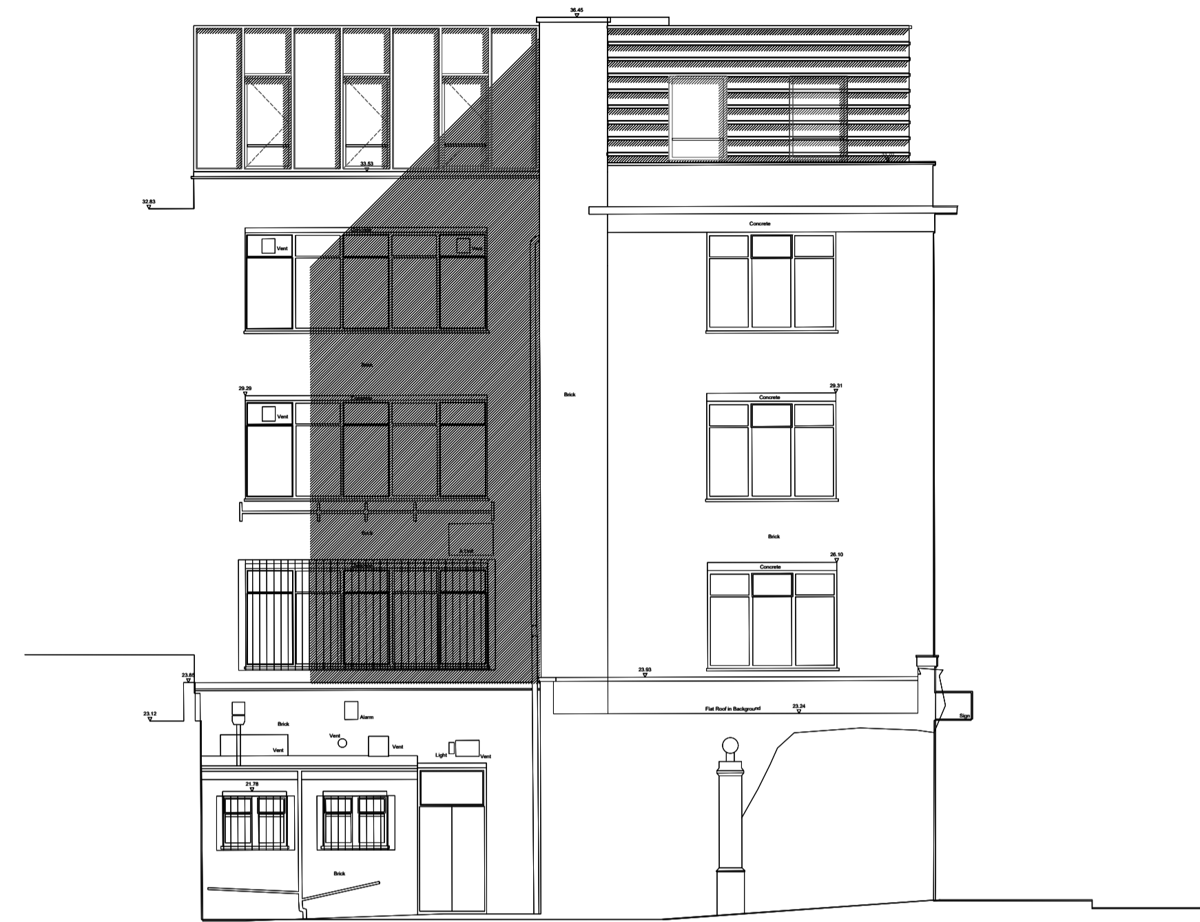
Proposed Quex Mews Elevation - @ 1:100 Please note - No external changes