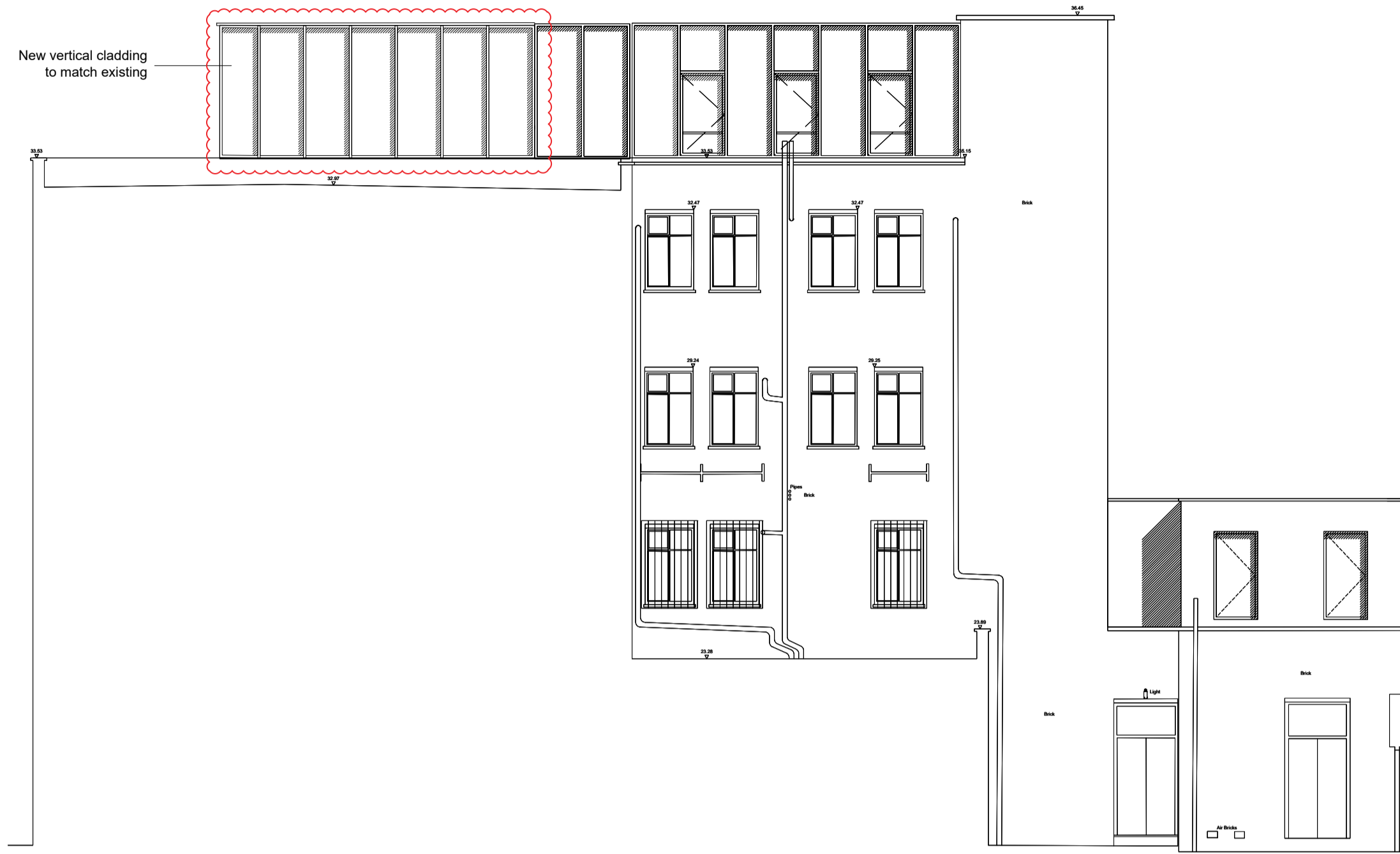
Proposed Rear Elevation - @ 1:100