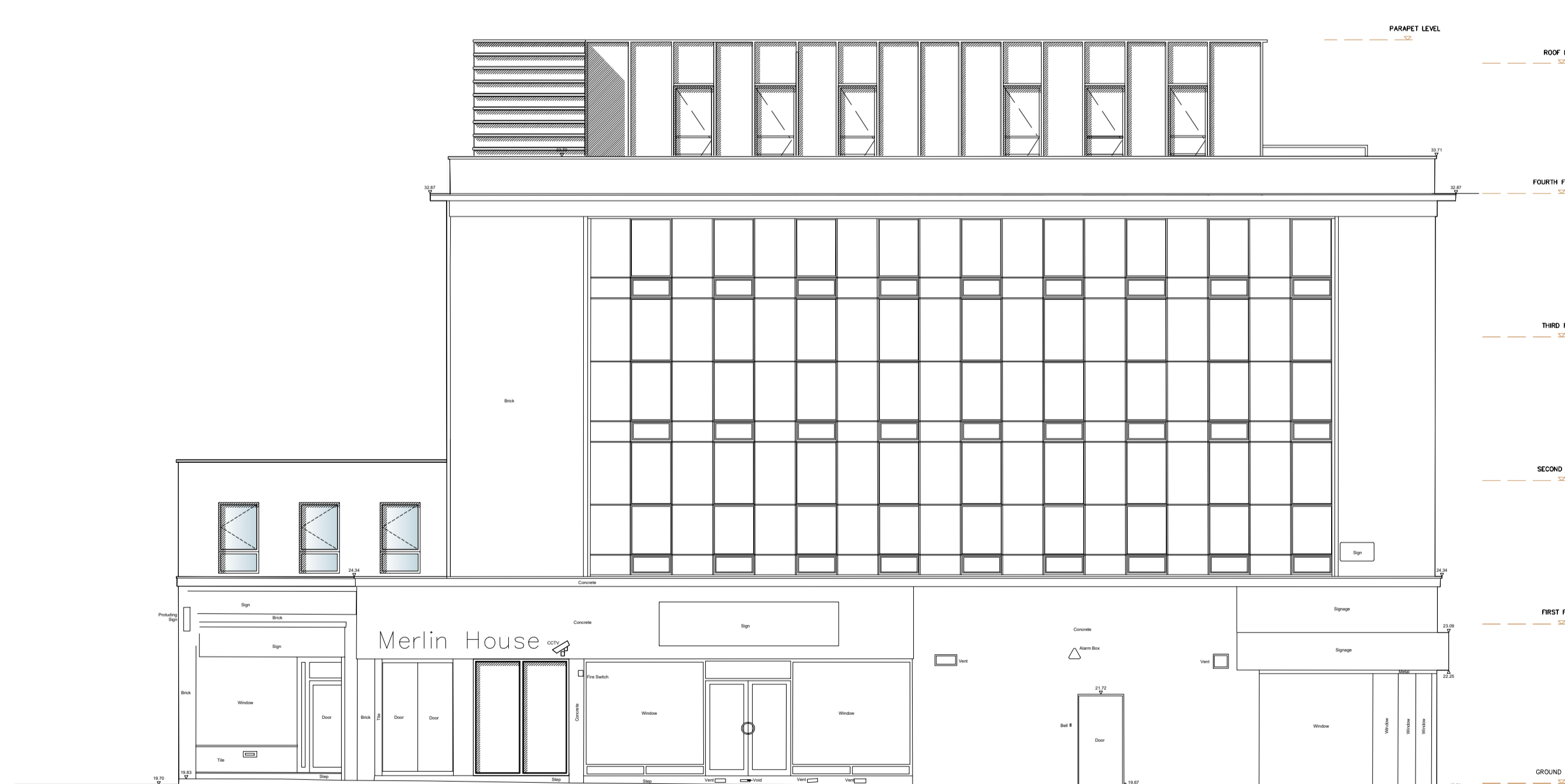
Existing Quex Road Elevation - @ 1:100