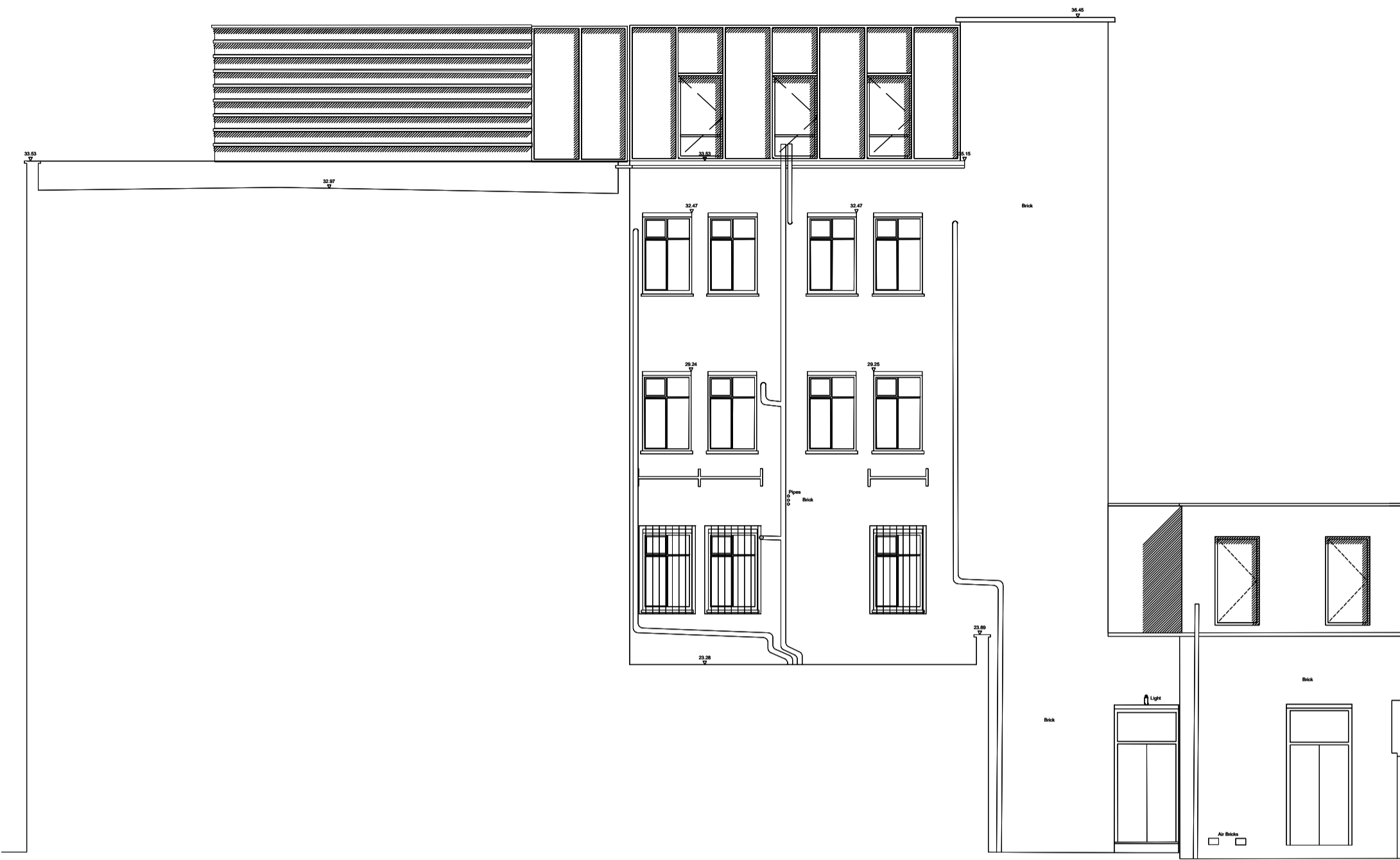
Existing Rear Elevation - @ 1:100