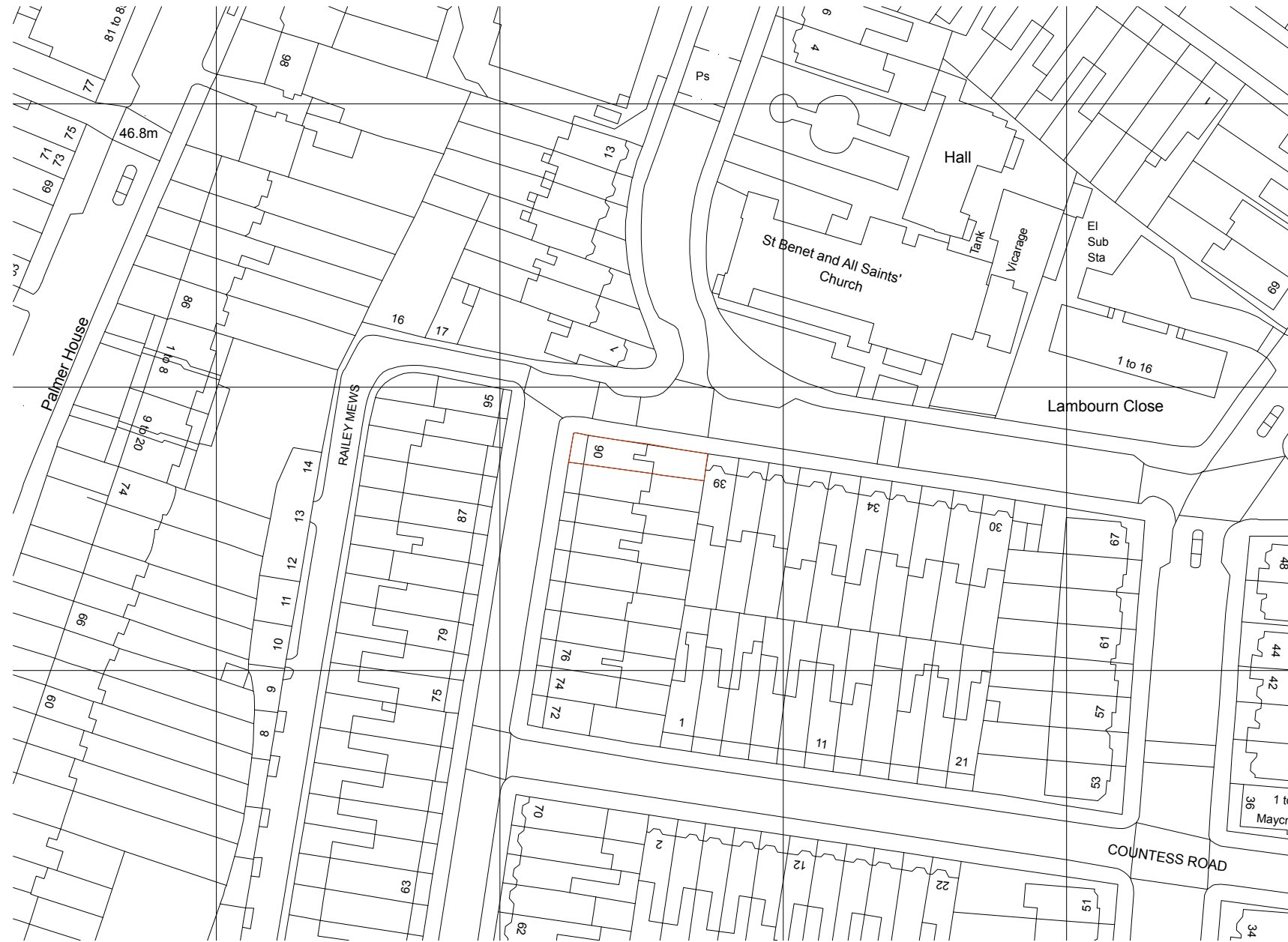
1 site location plan 1:1250