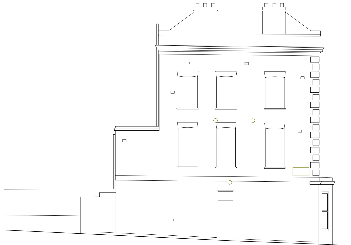
① Rear Elevation