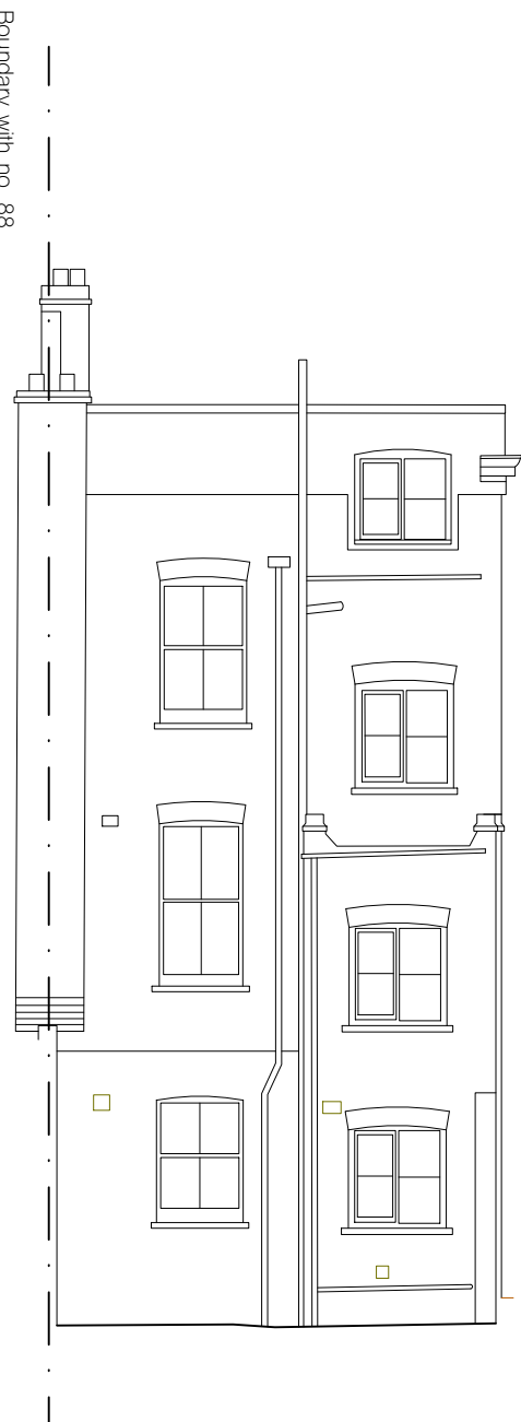
① Rear Elevation