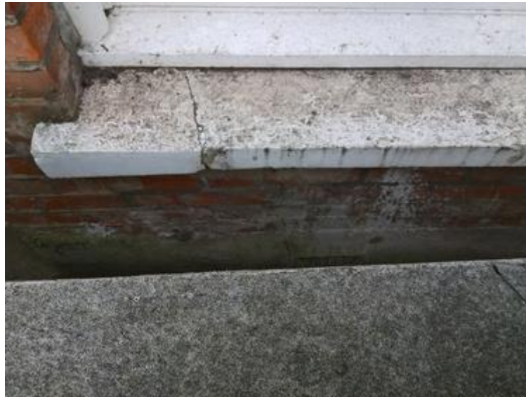
Fig 01 – Below front bay