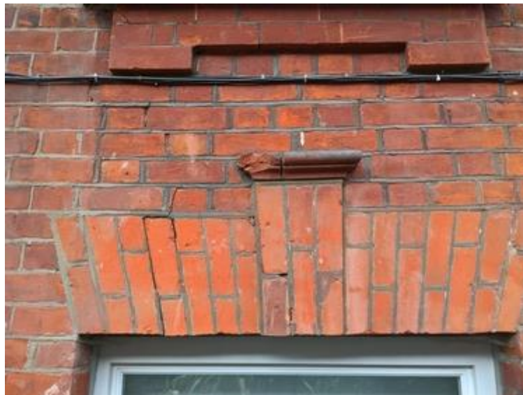
Fig 02 – Above front bay