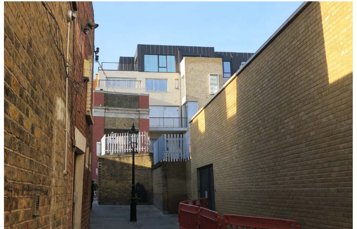
01. From Underhill Passage