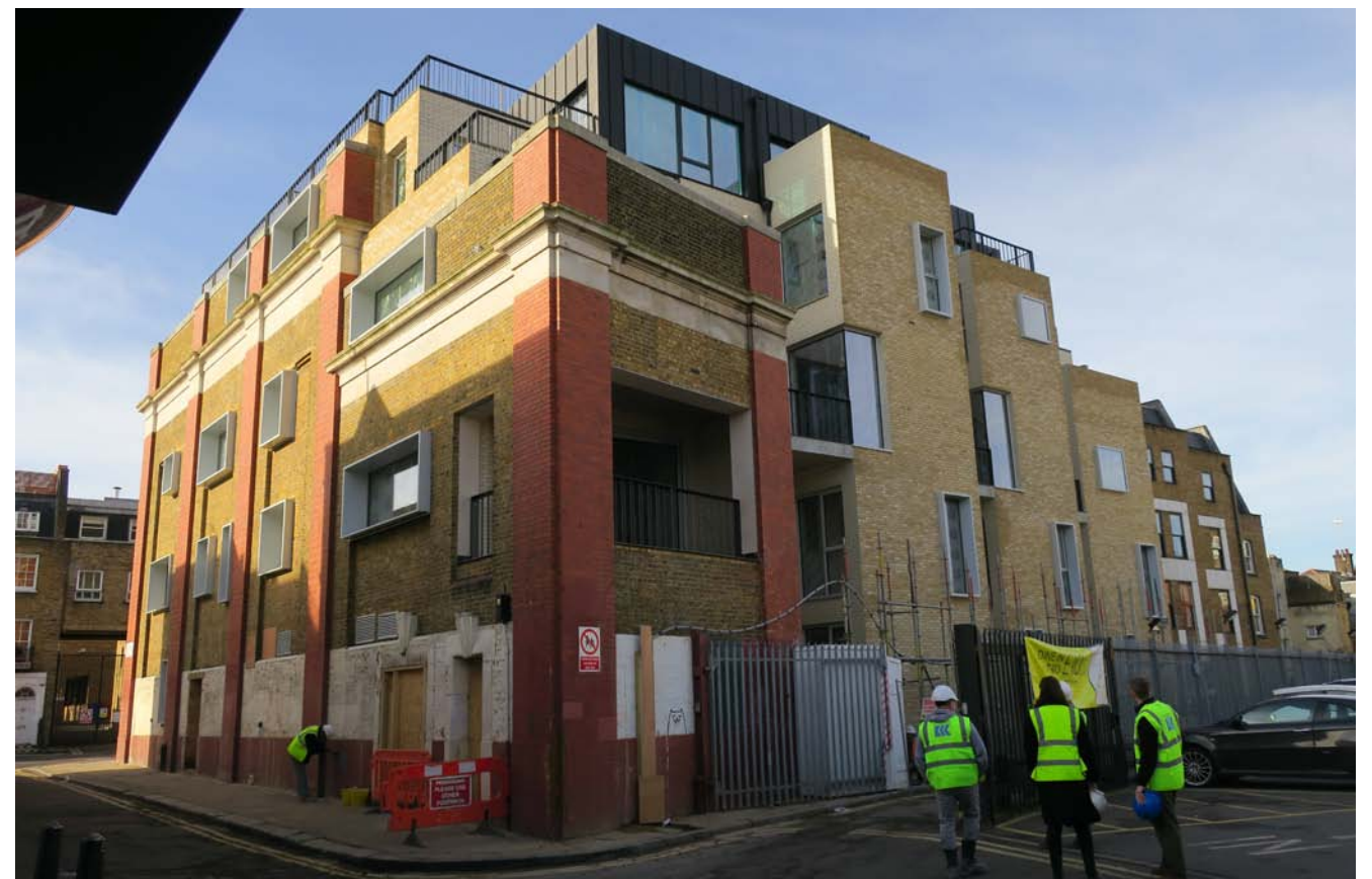
03. From Underhill Street