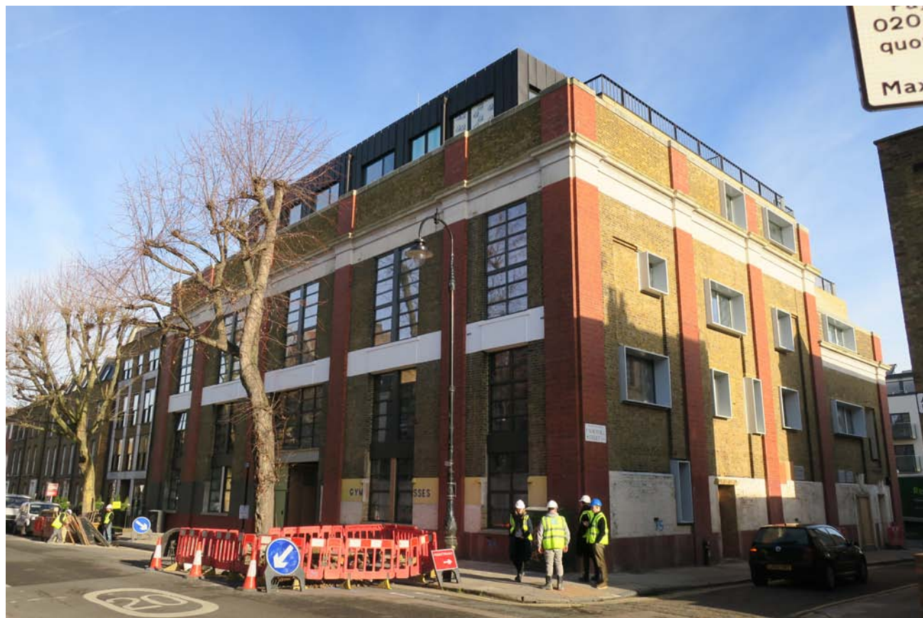
02. From Arlington Road