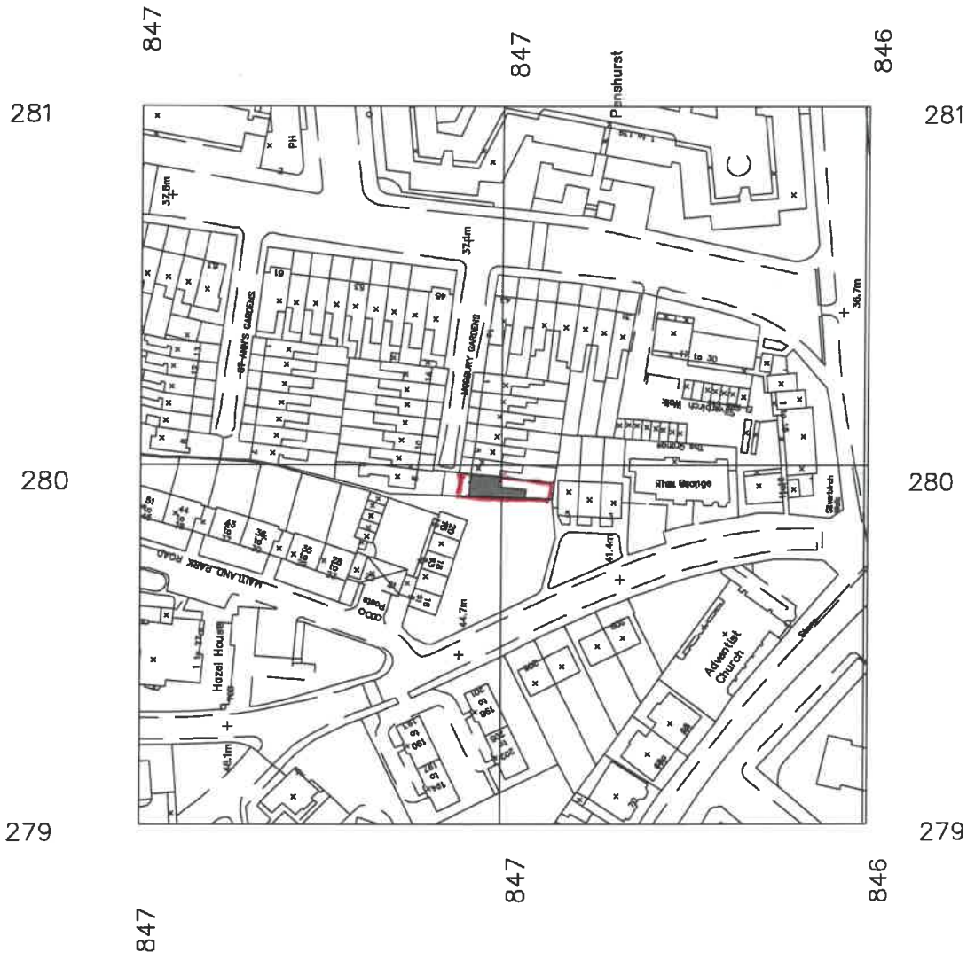
01 OS MAP 1:1250