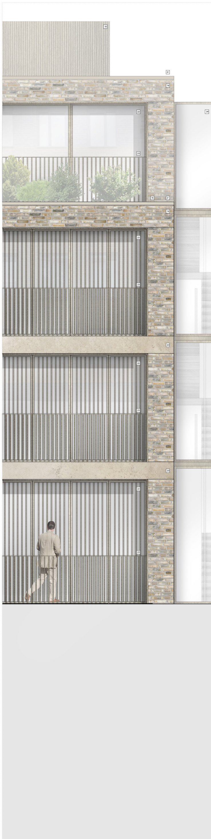
Proposed South West Elevation