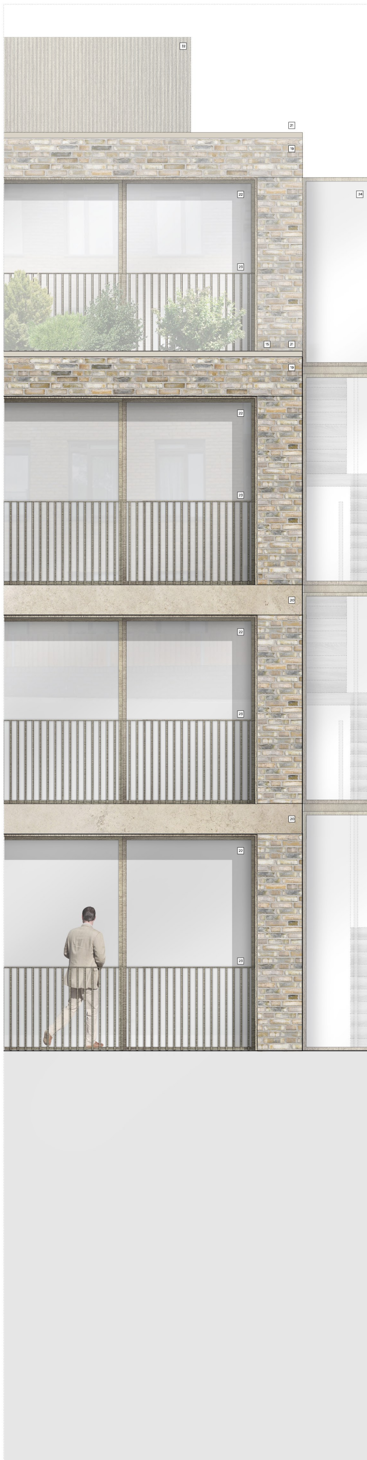
Proposed South West Elevation