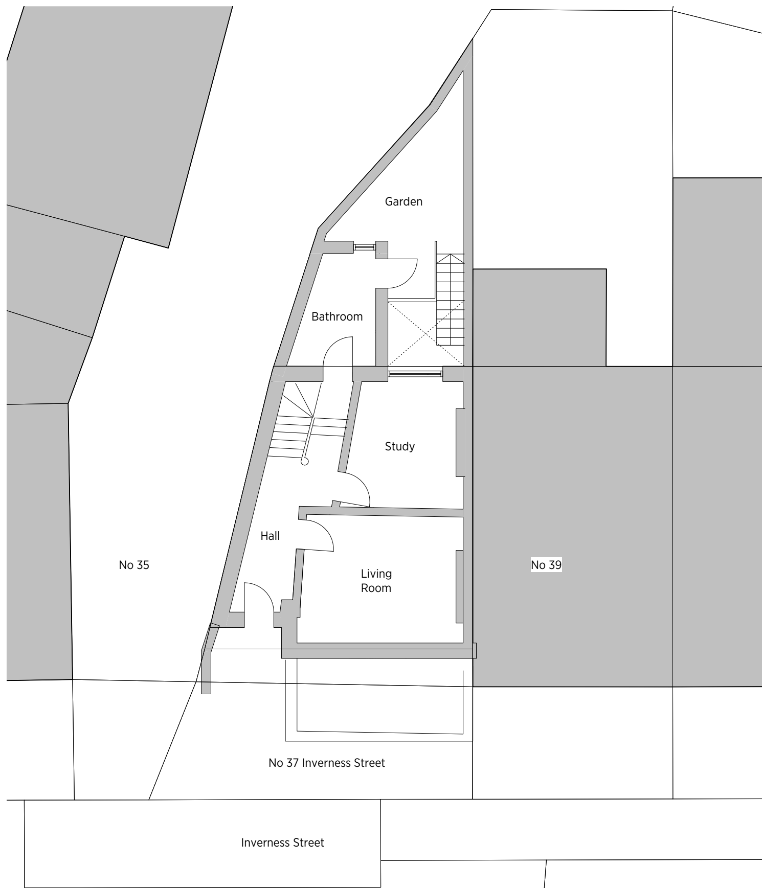
1 GROUND FLOOR PLAN 1: 50 @ A1, 1: 100 @ A3