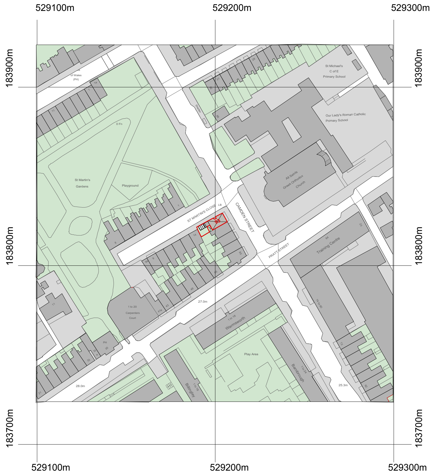
AREA PLAN scale 1:1250