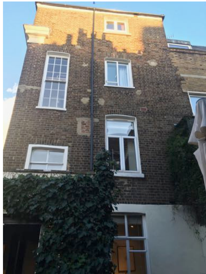
EXISTING REAR ELEVATION 93 CAMDEN ST