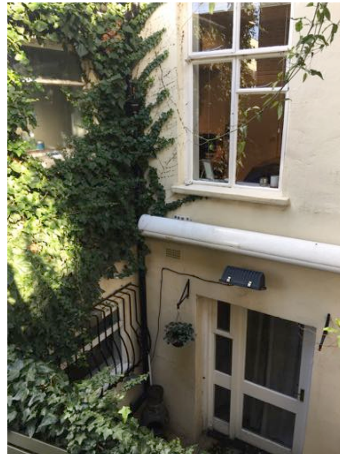
EXISTING BASMENT PATIO & WINDOWS AND GROUND FLOOR WINDOWS