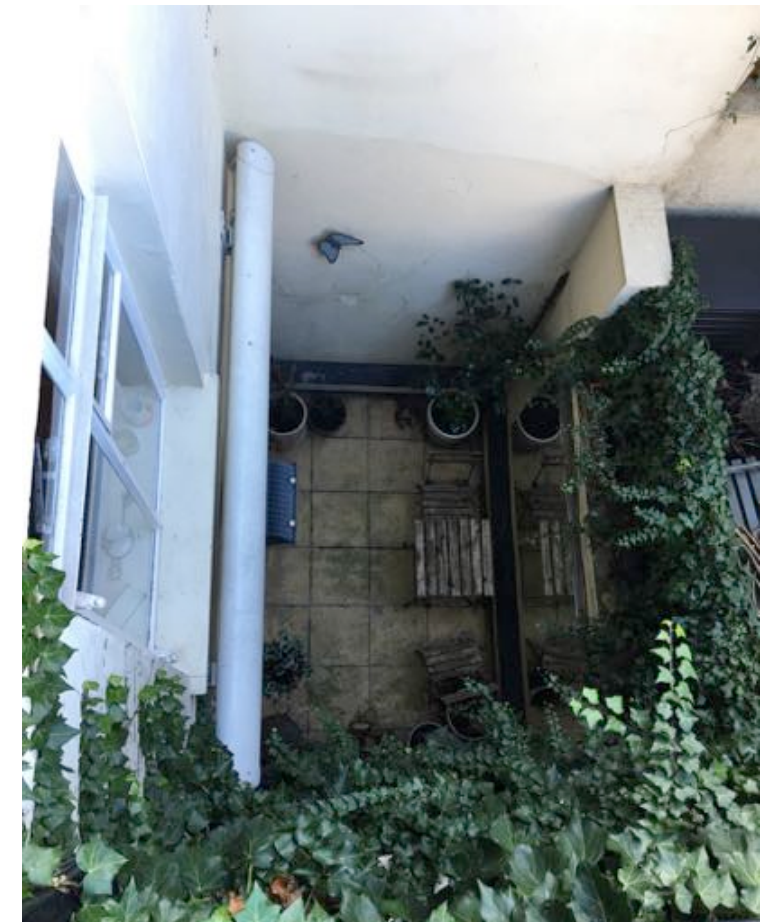
EXISTING BASMENT PATIO FROM ABOVE