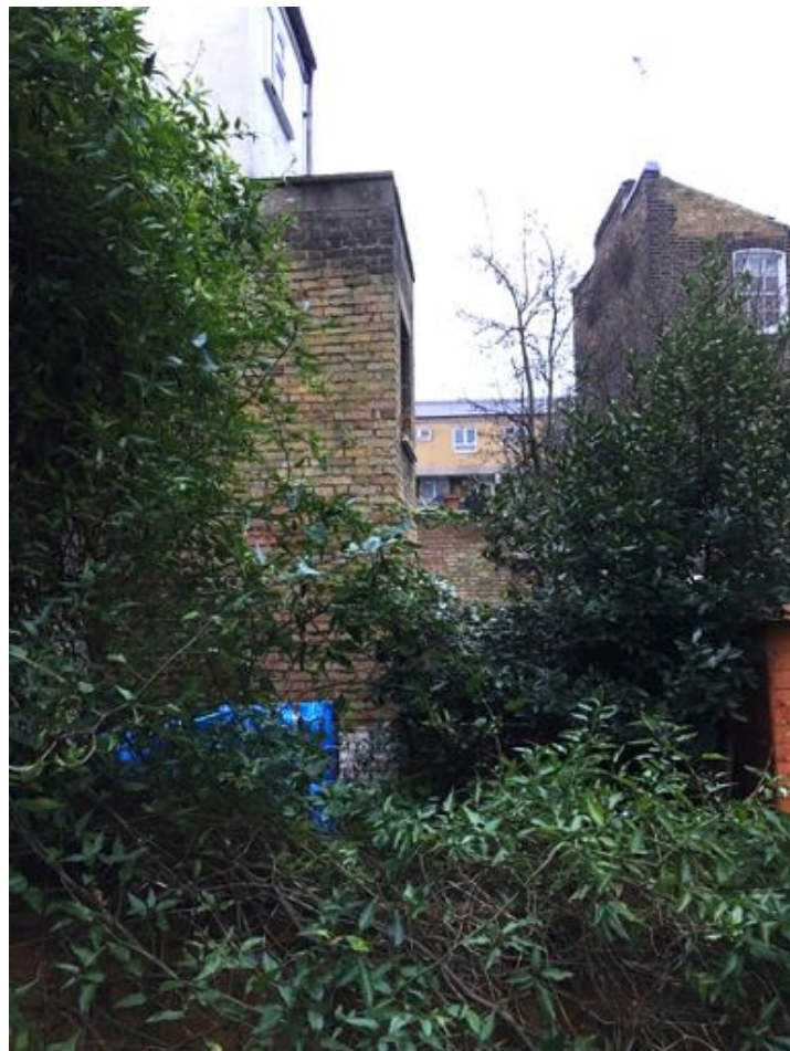
VIEW FROM GARDEN TOWARDS PRATT ST