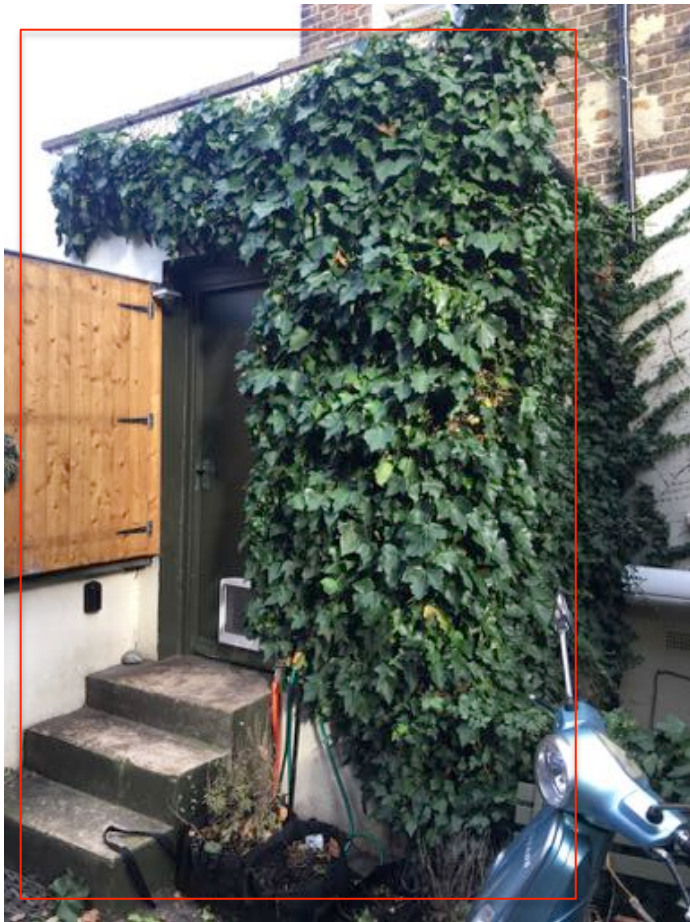
EXISTING REAR ELEVATION 93 CAMDEN ST LOCATION OF PROPOSED EXTENSION