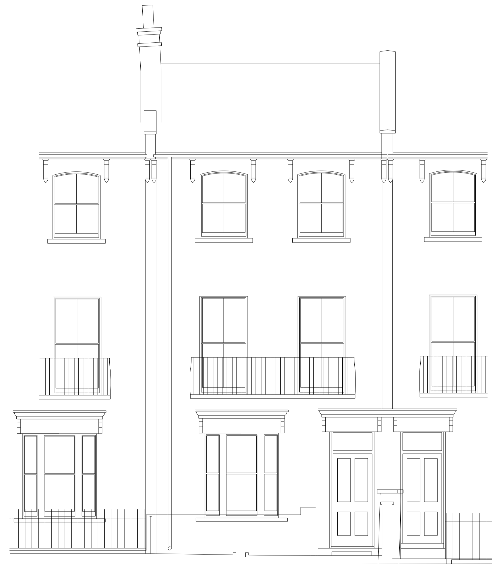
01- FRONT ELEVATION - PROPOSED