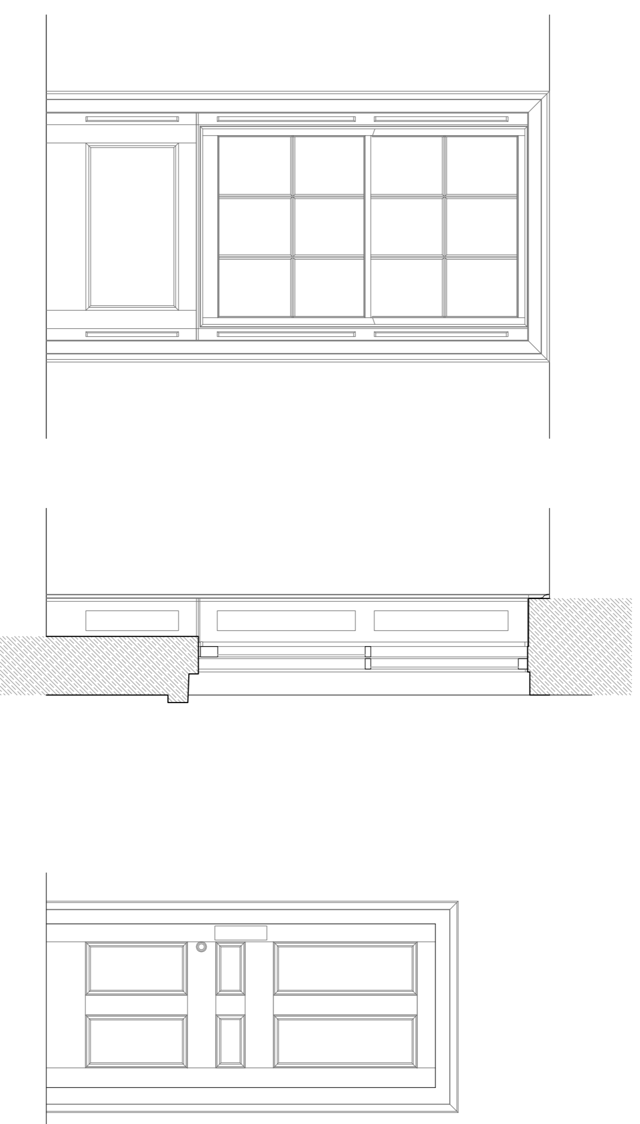
EXISTING JOINERY DETAILS