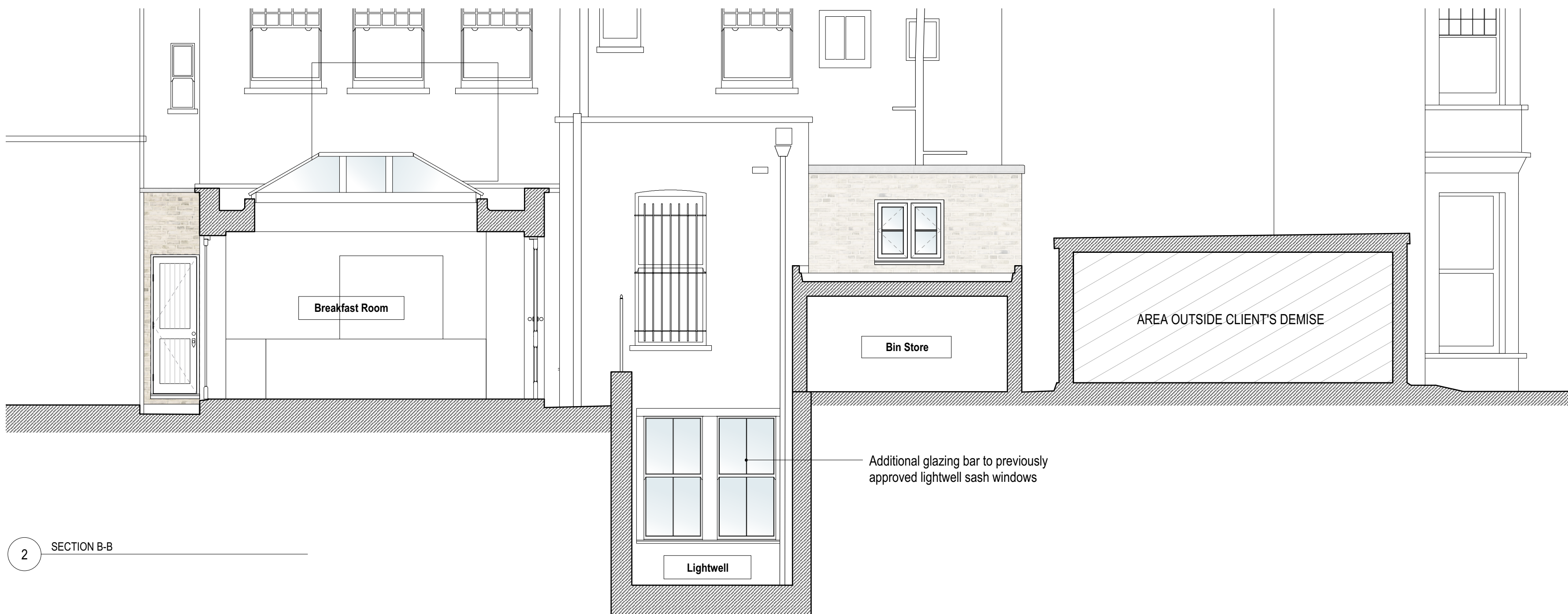
2 SECTION B-B

HATCH INDICATES AREA OUTSIDE THE CLIENT'S DEMISE