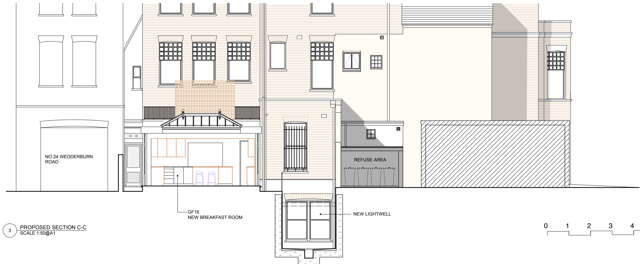
3 PROPOSED SECTION C-C SCALE 1:50@A1

ALL OTHER PROPOSED WORKS ALL APPROVED BY PLANNING APPEAL REF. APP/X5210/A/13/2192588, DATED 22 AUGUST 2013