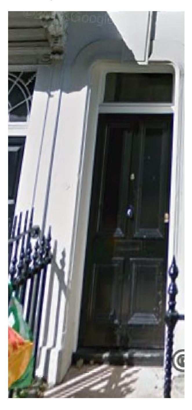
8 Rugby Street- Door Details