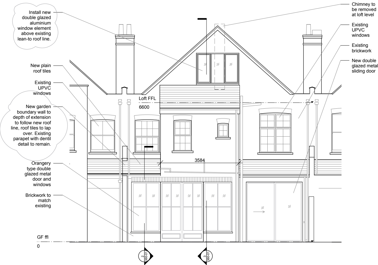
1 Rear elevation - Proposed 1:100