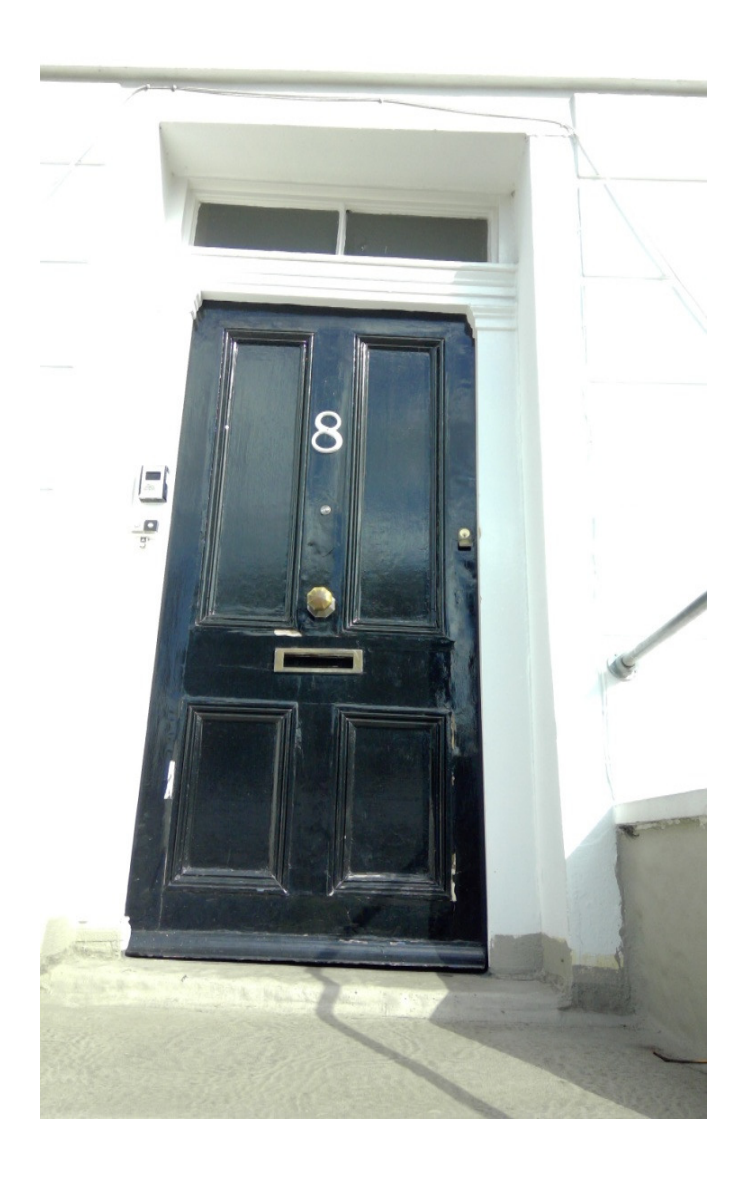
8 Rochester Road-Door Detail

The new door will aim to replicate the existing aesthetically and will re-use existing fixtures where possible. The new door will be fitted to the existing aperture requiring no alteration to the brick lintel or surrounding masonry.