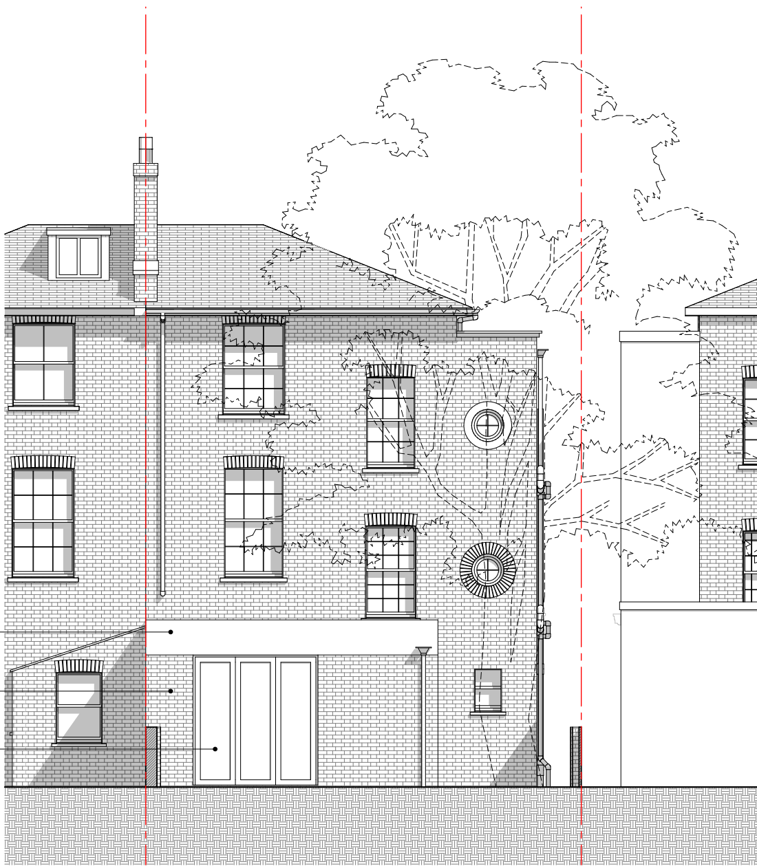
PROPOSED REAR (WEST) ELEVATION SCALE: 1:100@A3