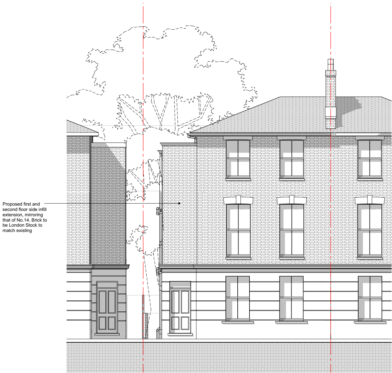
PROPOSED FRONT (EAST) ELEVATION SCALE: 1:100@A3