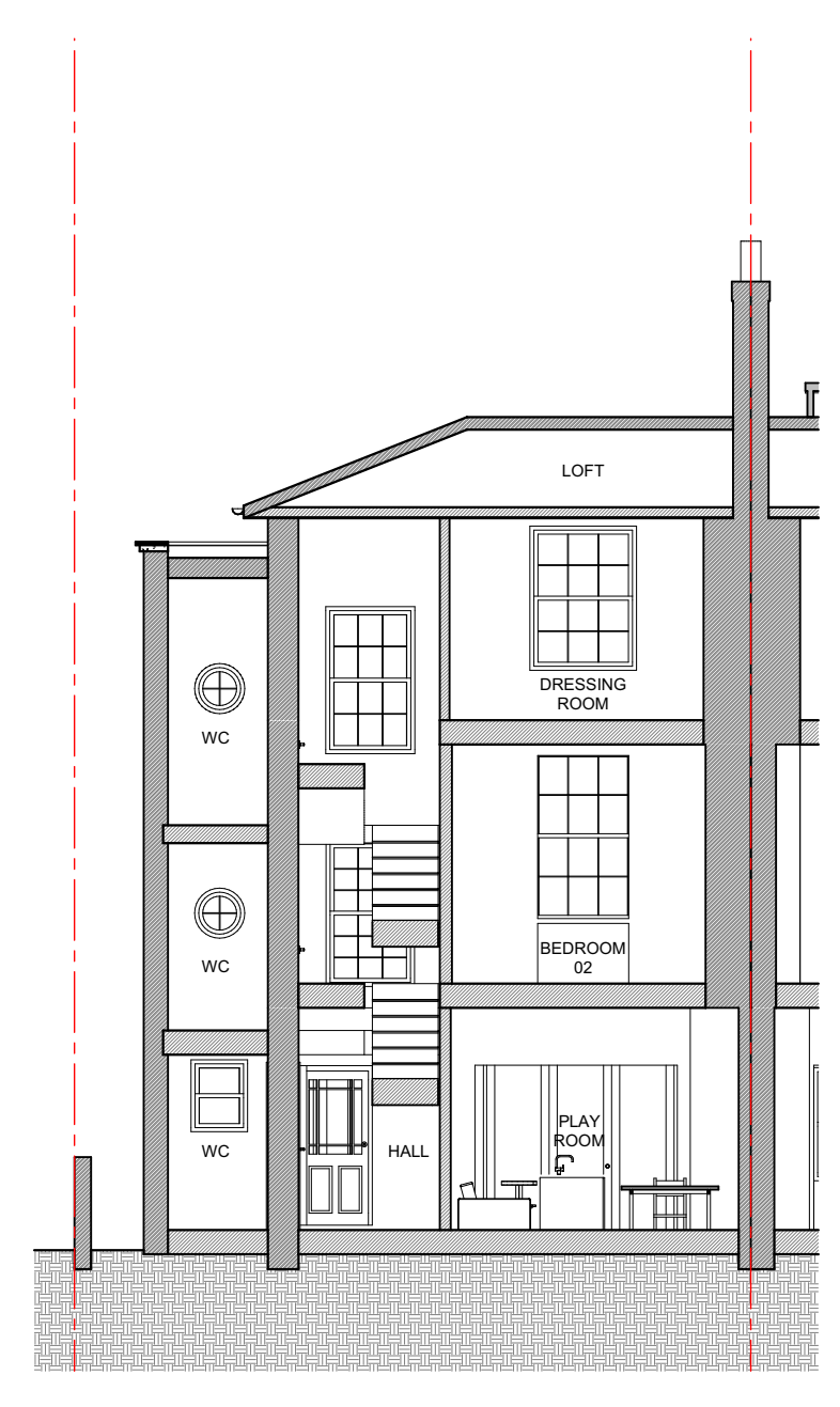
A-A - PROPOSED BUILDING SECTION SCALE: 1:100@A3