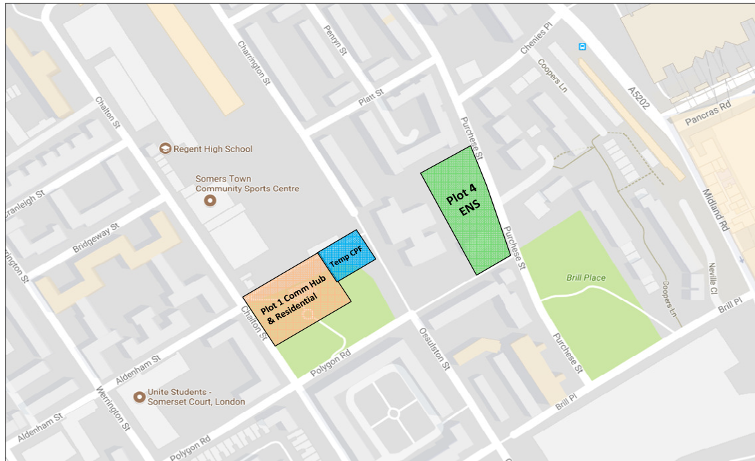
Central Somers Town Development – Plot 1 & 4 Site Location Plan

The works to the public realm covered by this CMP are within the existing site hoardings. No additional areas of the Public Open Space are required to be closed off to undertake these contracted works of the development. The works consists of 2 Plots: