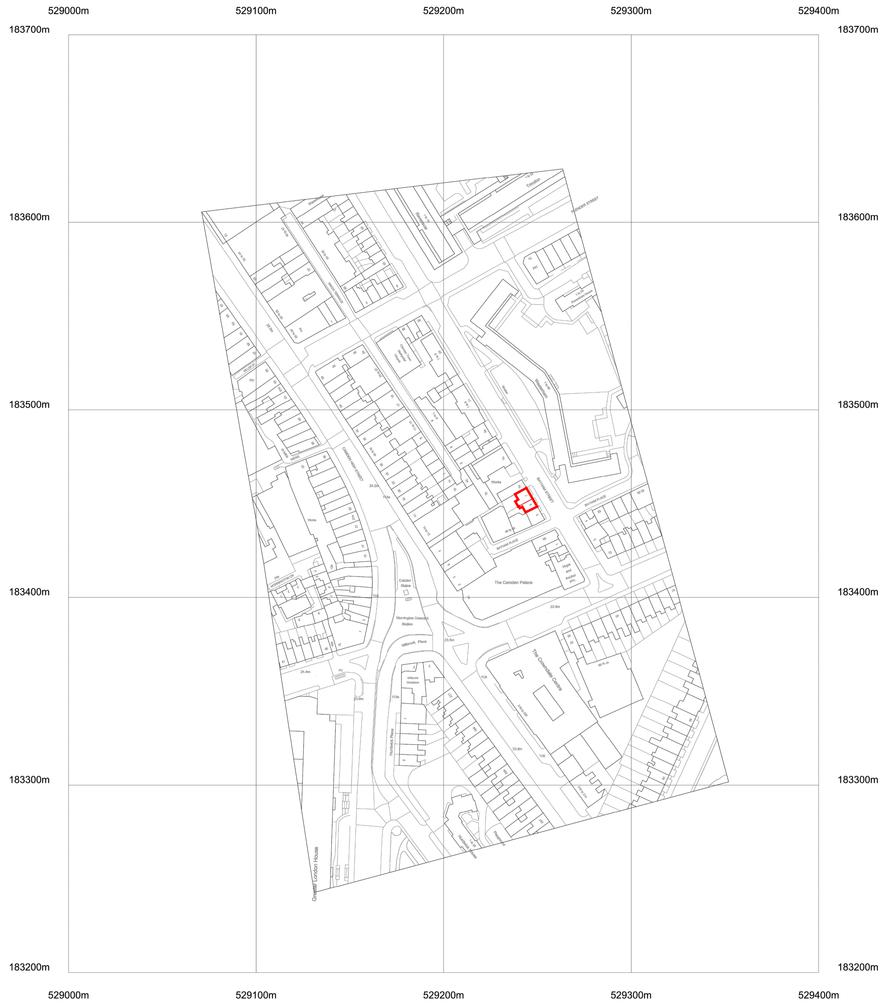
01 Site Location Plan 1:1250