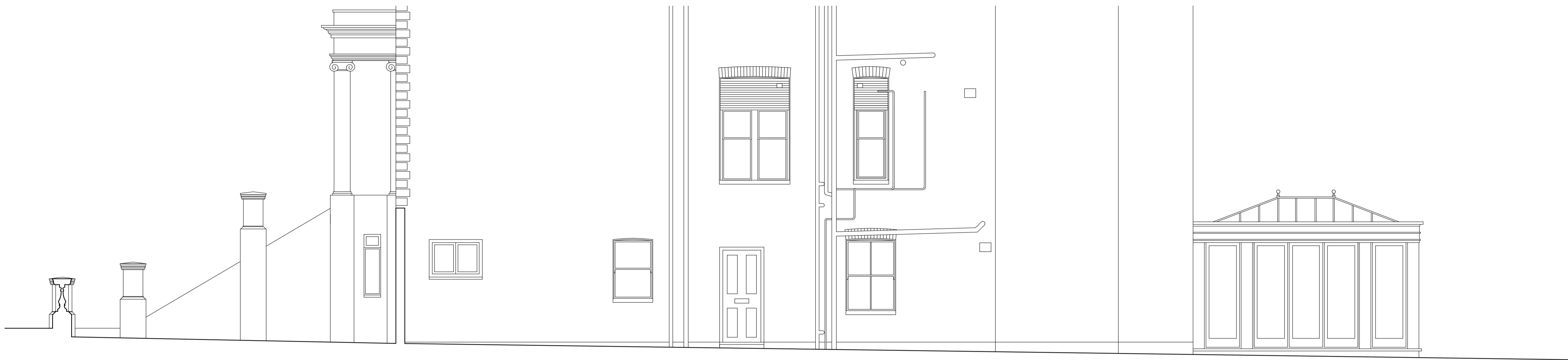
1 Existing Side Elevation 1 : 50