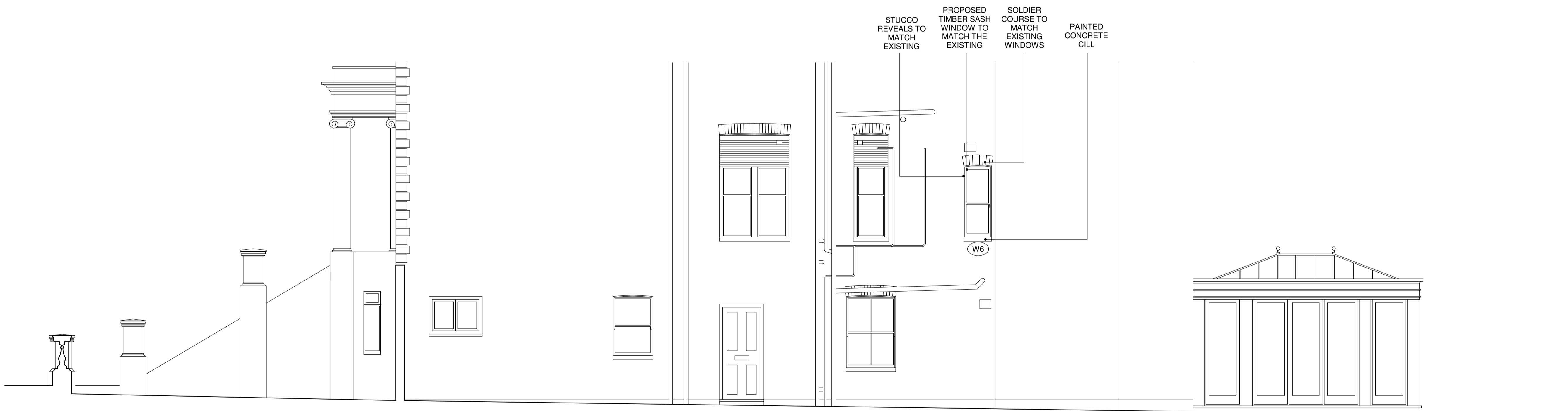
2 Proposed Side Elevation 1 : 50