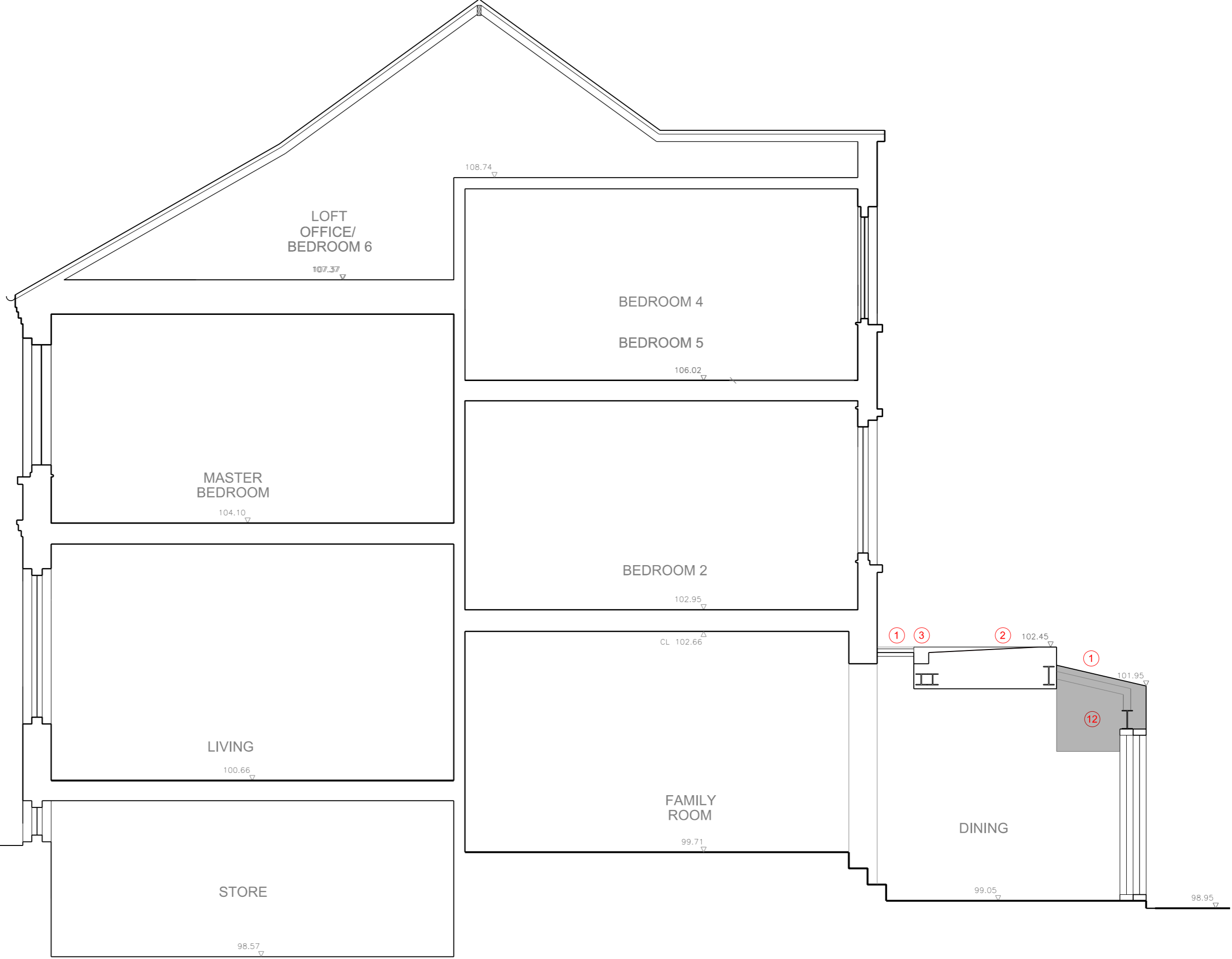
1 PROPOSED SECTION B-B - REAR EXTENSION