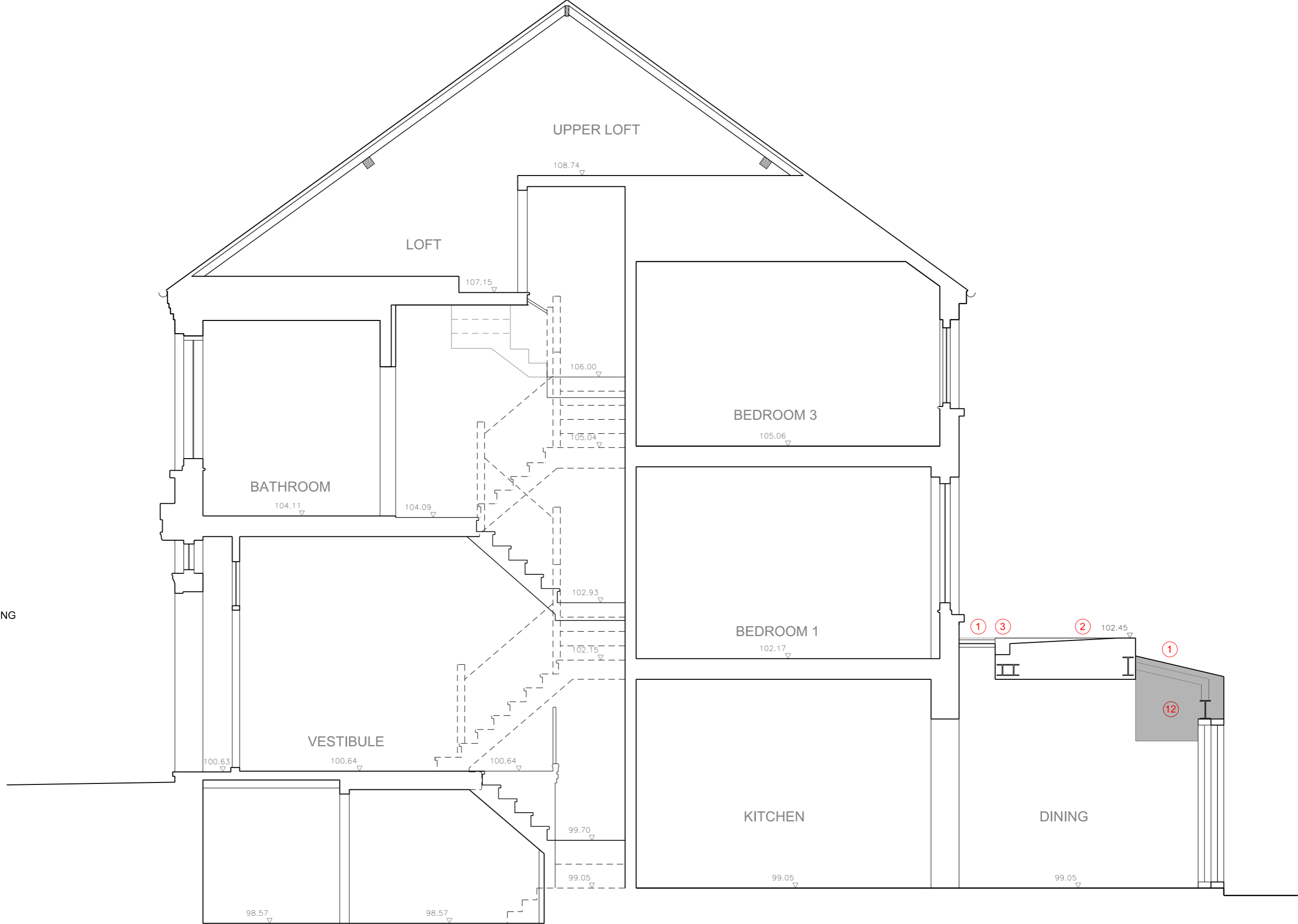
1 PROPOSED SECTION A-A - REAR EXTENSION