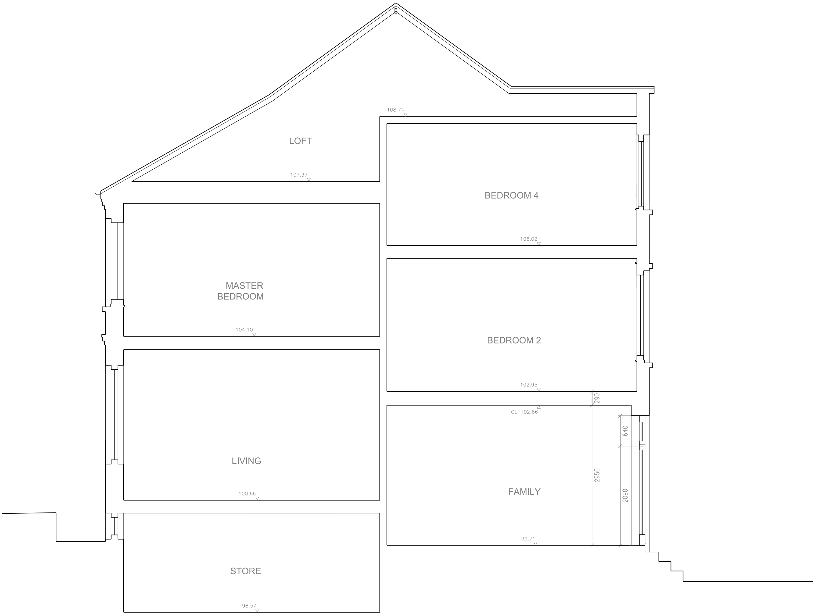
1 EXISTING SECTION B-B - REAR EXTENSION