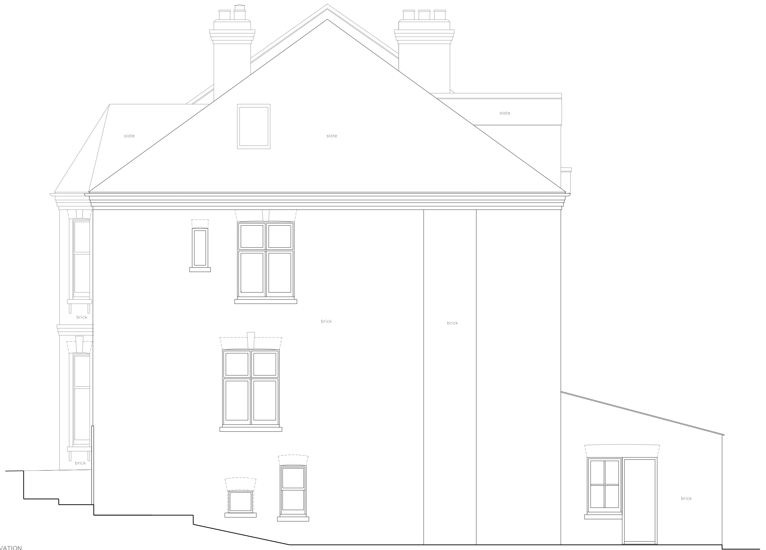
1 EXISTING SIDE ELEVATION - REAR EXTENSION