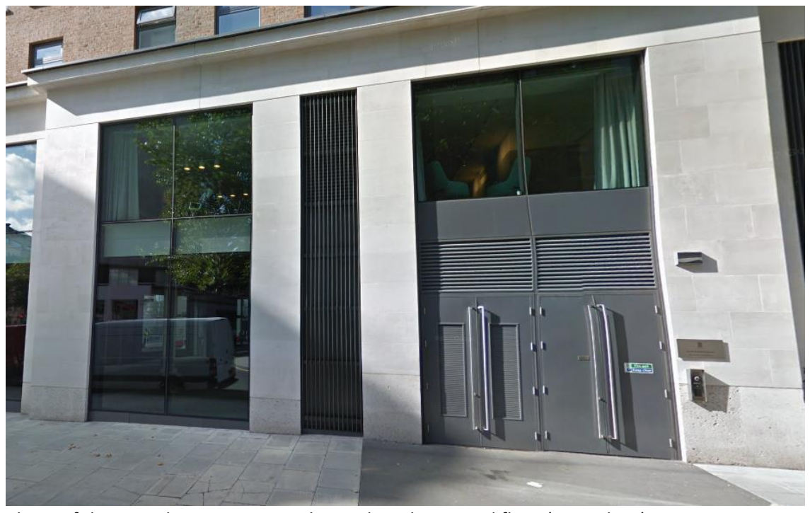
Photo of the East Elevation Louvres located on the ground floor (Bury Place)