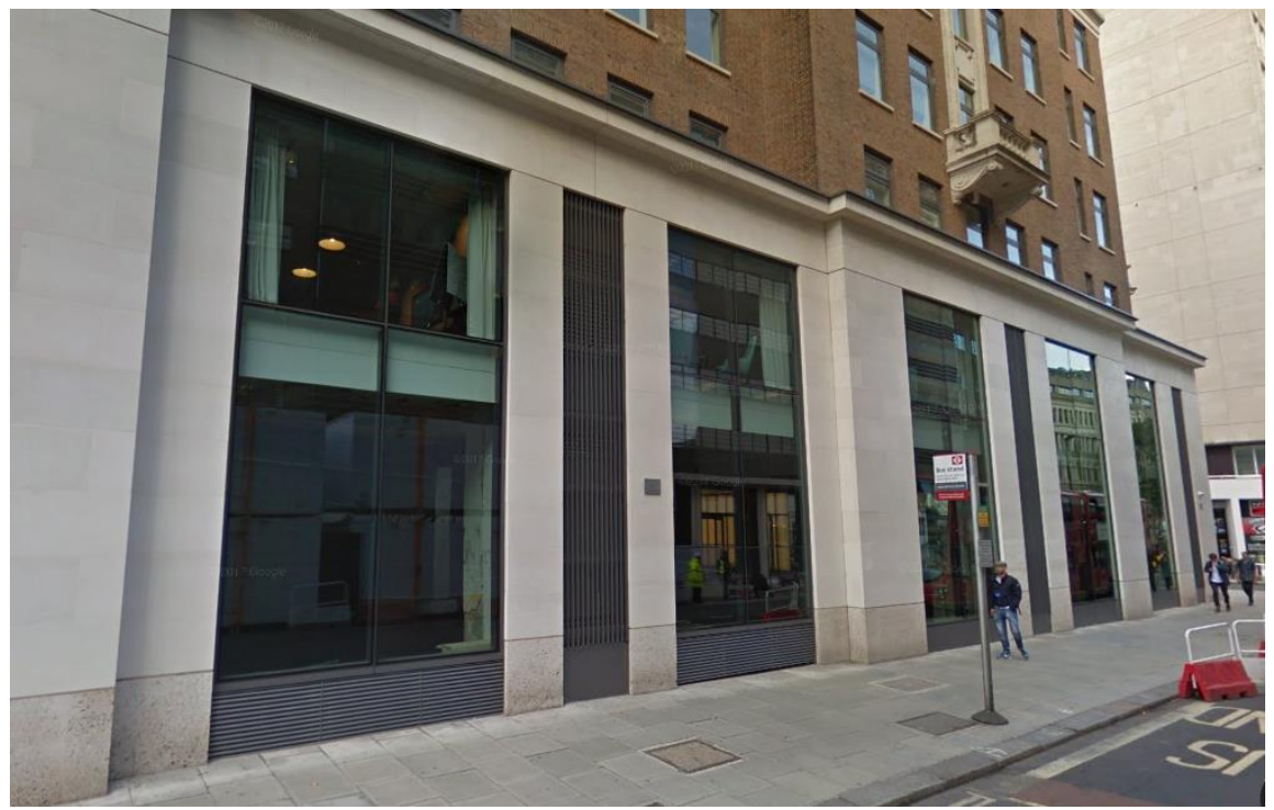
Photo of the South Elevation Louvres located on the ground floor (New Oxford Street)