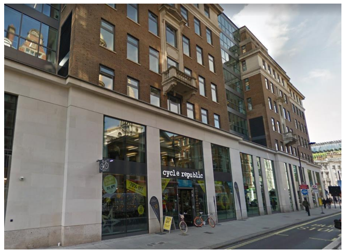
Photo of the North Elevation showing the Louvres located on the ground floor and the first floor (Bloomsbury Way)

Our proposed louvres would be of the same design and materials as the existing louvres, and would therefore cause no material harm to the existing building, or the wider area in line with Policy D2 Heritage of Camden's Local Plan. In addition, the proposal would be in line with principle O of Policy D1 'Design' of Camden's Local Plan which requires development proposals to carefully integrate building services equipment. Principle D of Policy D1 'Design' also highlights that design should be flexible and adaptable for a range of uses over time. The additional louvres constitute a vital change to the design of the building to enable the effective functioning of the retail unit.