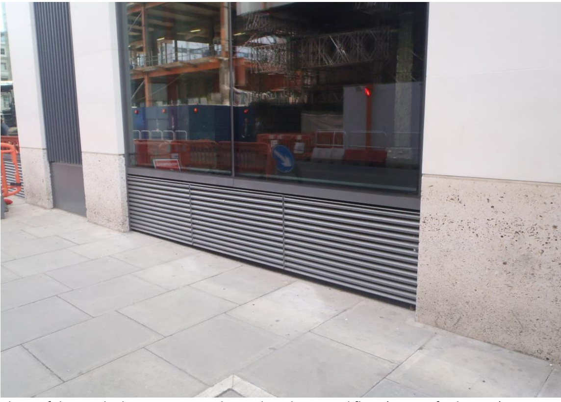
Photo of the South Elevation Louvres located on the ground floor (New Oxford Street)