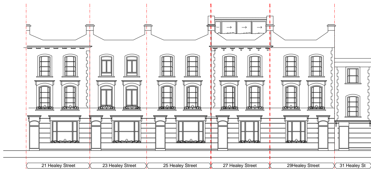
Proposed Front Context Elevation 1:200 @ A3