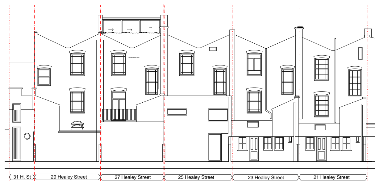
Proposed Rear Context Elevation 1:200 @ A3