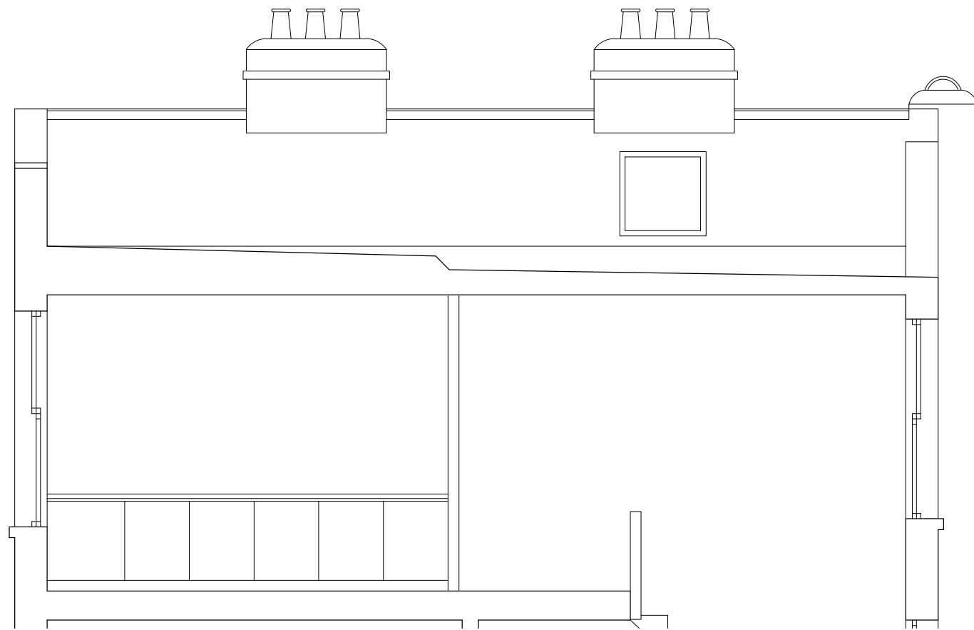
Existing Section AA 1:50 @ A3