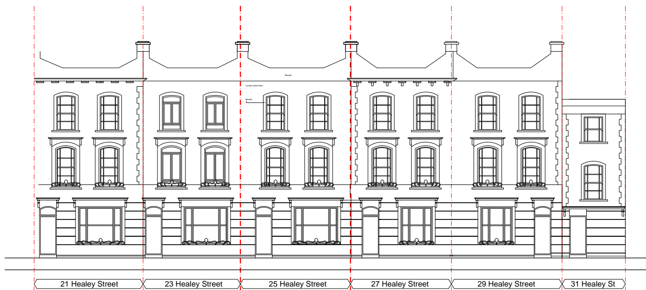
Existing Front Context Elevation 1:200 @ A3