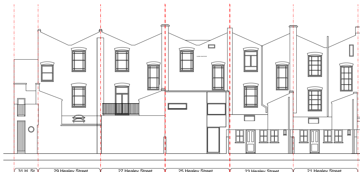
Existing Rear Context Elevation 1:200 @ A3