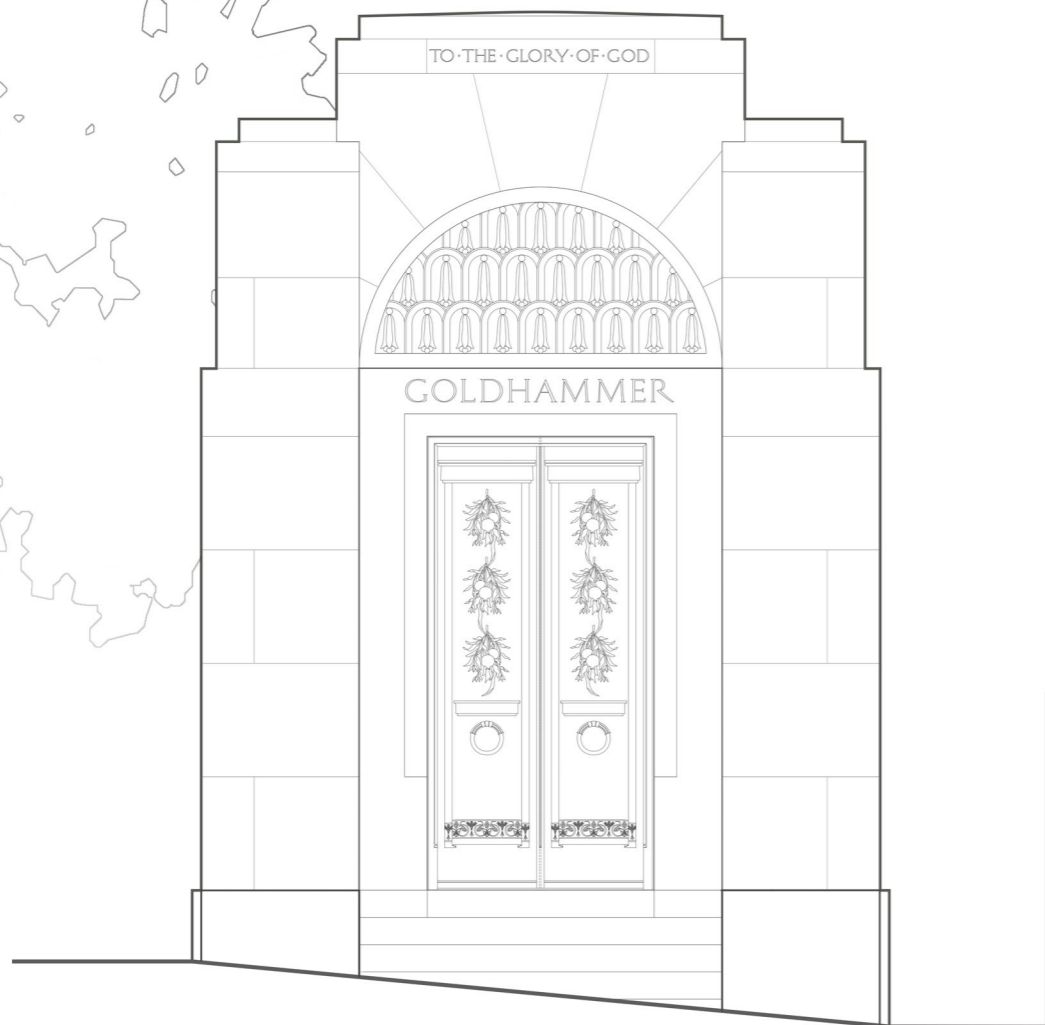
SOUTH WEST ELEVATION 1:50